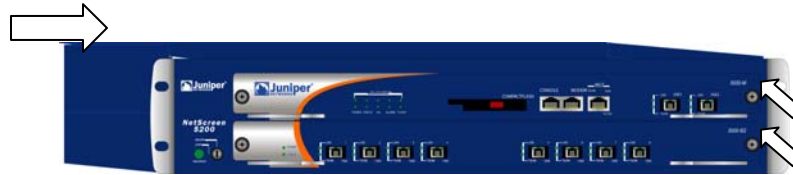
Location of Tamper Evident Seals