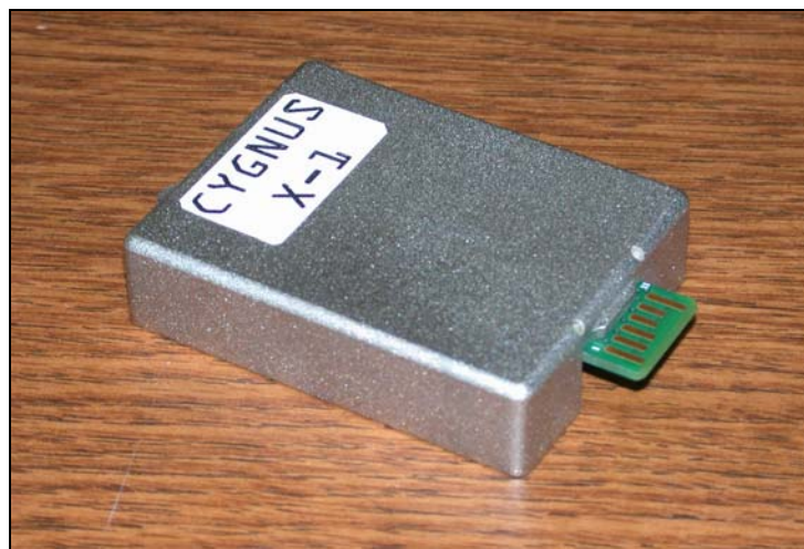
Figure 2 - Photograph of Physical Configuration