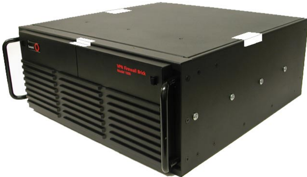
Figure 2 – Tamper evidence label placement on front panel/top

the enclosure and the other half covers the side of the module. Any attempt to remove the enclosure will leave tamper evidence.