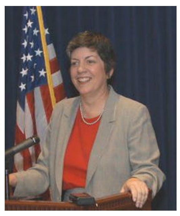
The Honorable Janet Napolitano, Governor of Arizona

These are exciting times for the Arizona Workforce Connection, Arizona's workforce development system. In my 2003 "State of the State" address, I announced the building of a new Arizona economy as one of my priorities. In order to move the economy of Arizona forward, the state must develop a labor pool with strong technical and academic foundations. A highly qualified workforce will attract businesses that create high-wage jobs. To that end, workforce development is a primary economic development tool.