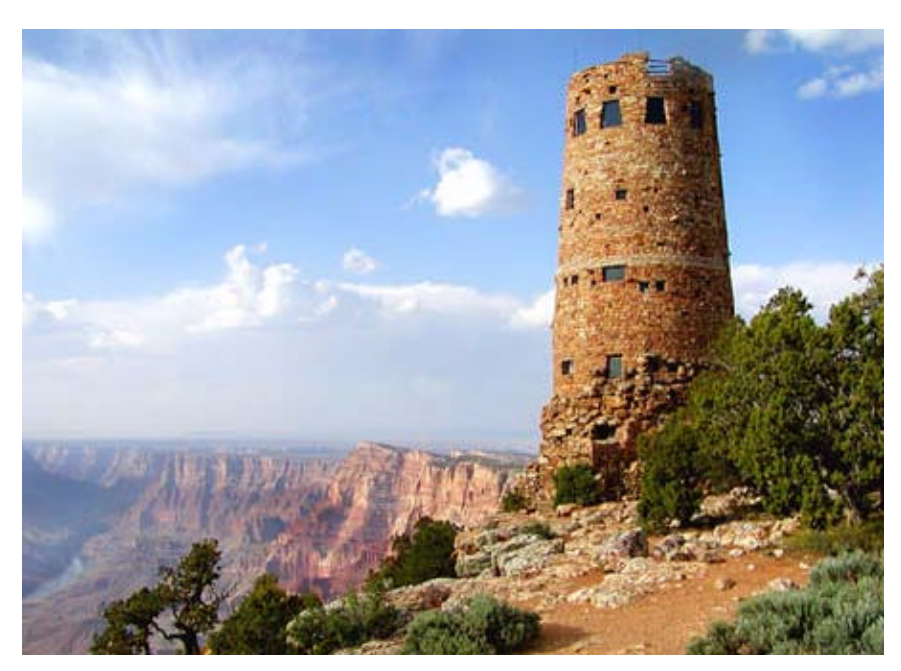
Desert View Watchtower, Grand Canyon Arizona

The Governor's Council on Workforce Policy adopted the Arizona Workforce Connection as the statewide brand for the delivery of workforce services to businesses and job seekers. Key activities in marketing the new brand include the creation of <a href="https://www.ArizonaWorkforceConnection.com">www.ArizonaWorkforceConnection.com</a>, the purchase of a trade show booth which has been used at over 30 different workforce events since March 2003, and a toll-free hotline for businesses. In addition, over 75,000 marketing brochures and folders were distributed to the local workforce investment areas for presentations and workshops. Local One-Stop centers are in the process of incorporating the use of the statewide brand into locally published materials.