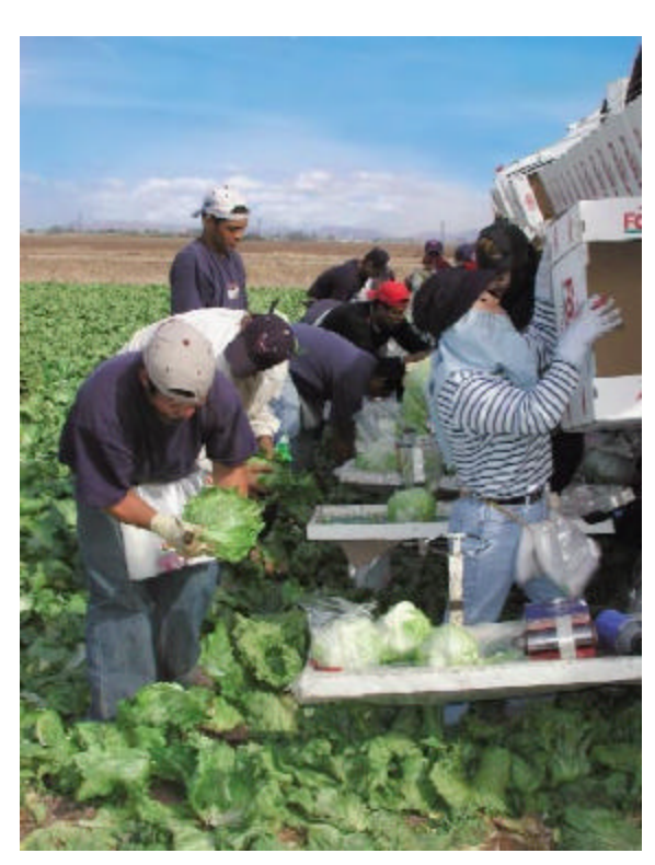
Migrant Farmworkers harvesting lettuce in Yuma County.