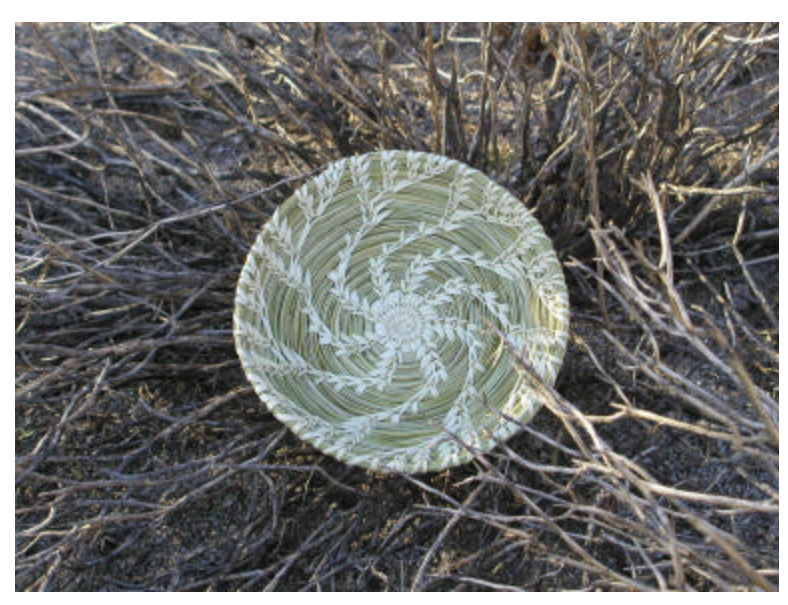
Gila River Indian Community Woven Basket