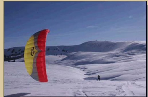
Kiteboarding has become a very popular outfitter and guide activity.