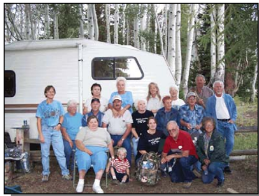
Some 2007 seasonal and volunteer workers gathered on the forest.