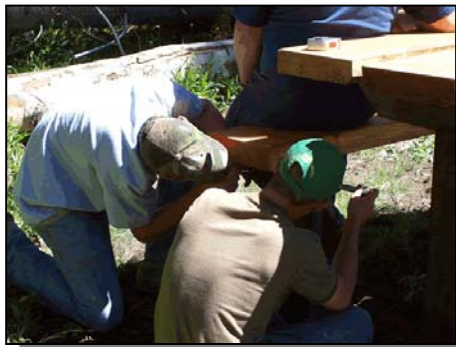
Scouts construct a new picnic table.