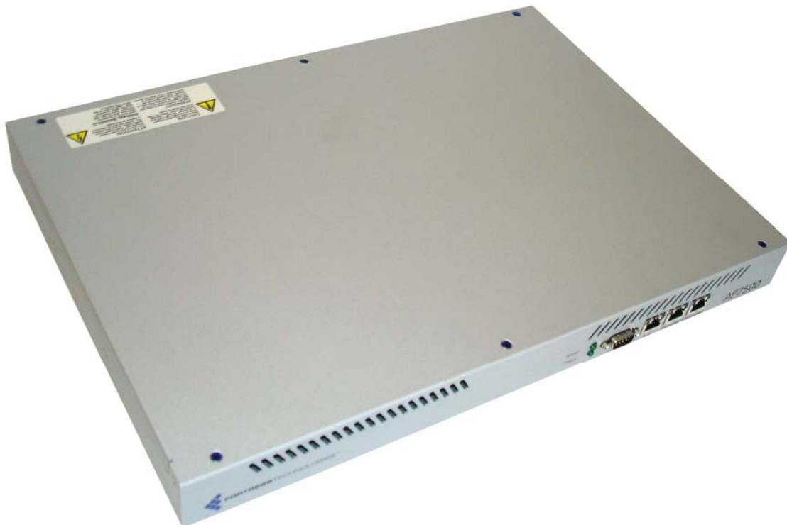
Figure 4: Top and Front View of the AF7500 Hardware Showing the Blue Thread Locker