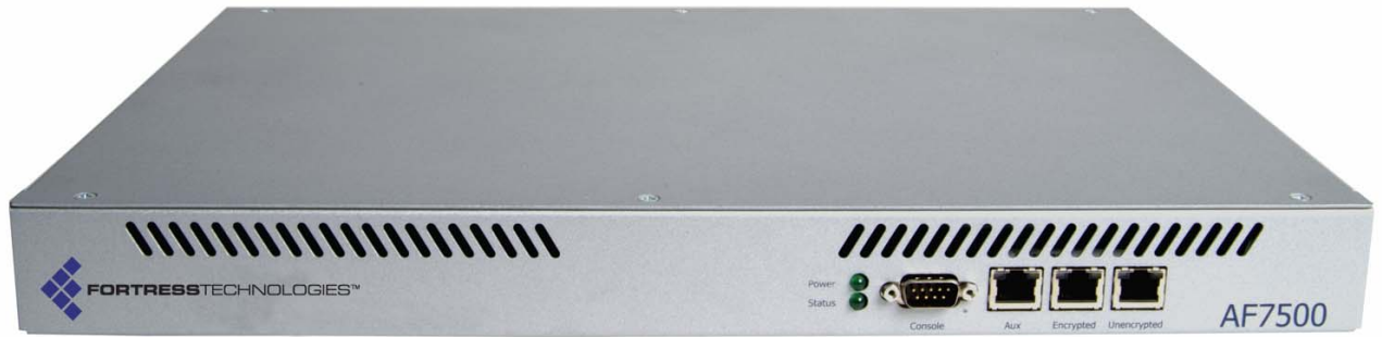
Figure 3: Front View of the AF7500 Hardware