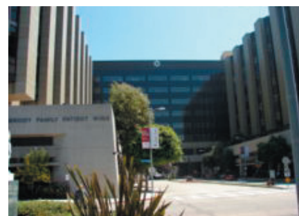
Cedars-Sinai Medical Center

A Because we receive over 500 Declarations per day, we do not acknowledge receipt. To find out if your Declaration is on file, you can submit a Parents Request Form (found on the DCSS website, www.childsup.ca.gov/Program/POP/Requestdecl ), and we will send you a certified copy free of charge.