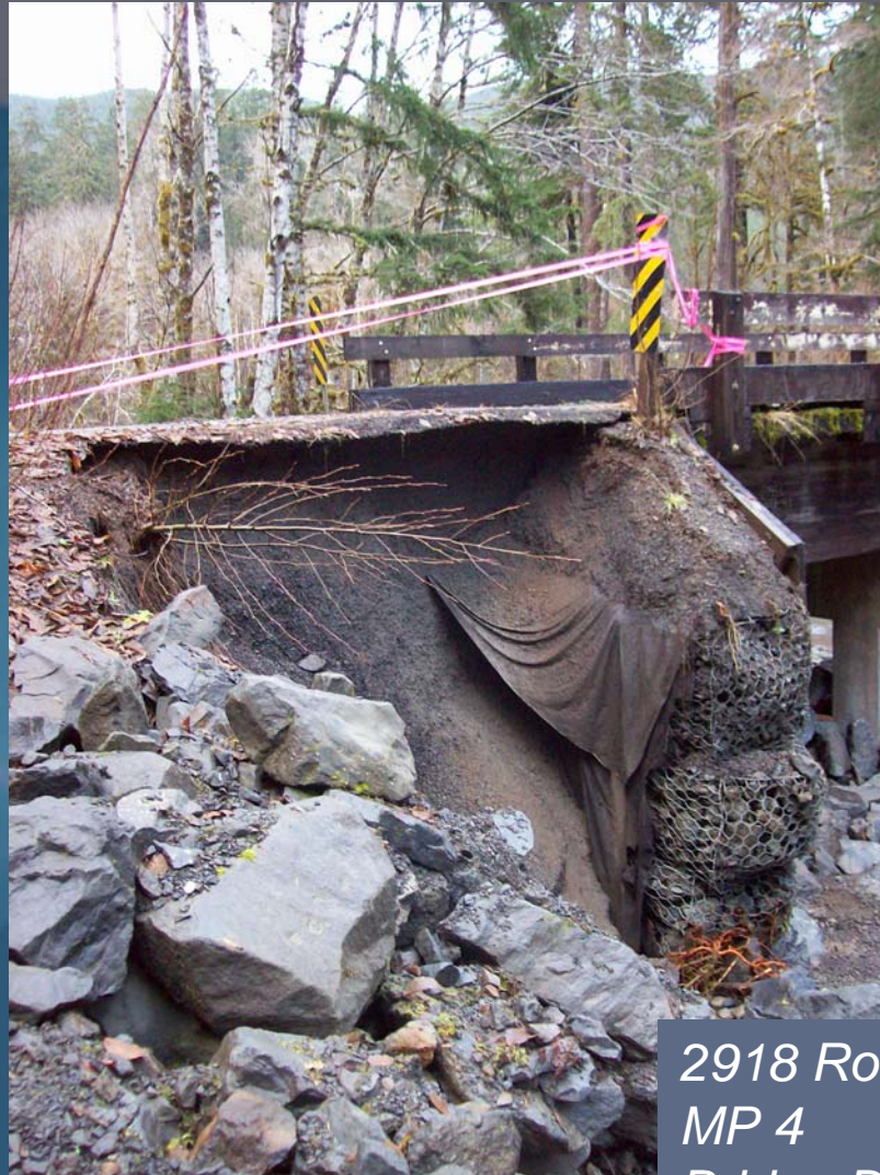
2918 Road MP 4 Bridge Damage