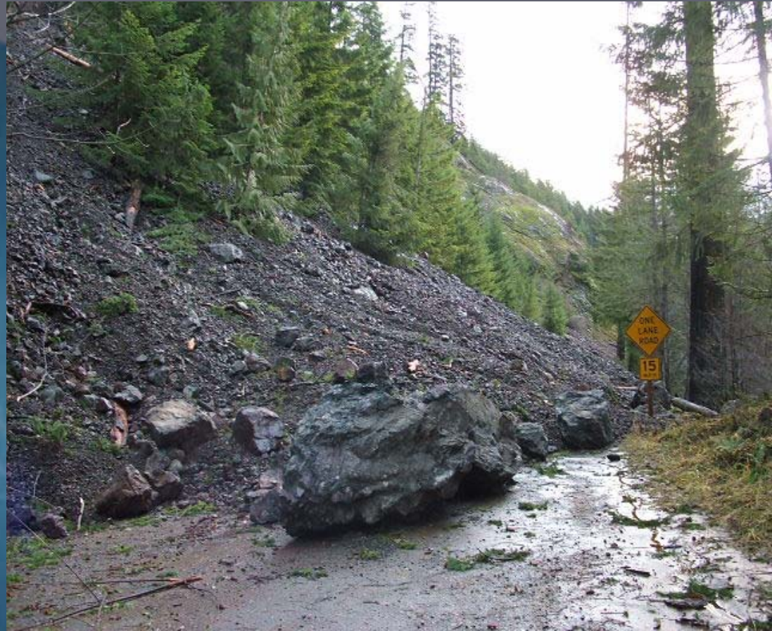
Debris slide, FR 24

The Olympic National Forest suffered damage to trees, roads, streams and rivers, wildlife habitat, facilities, and trails.