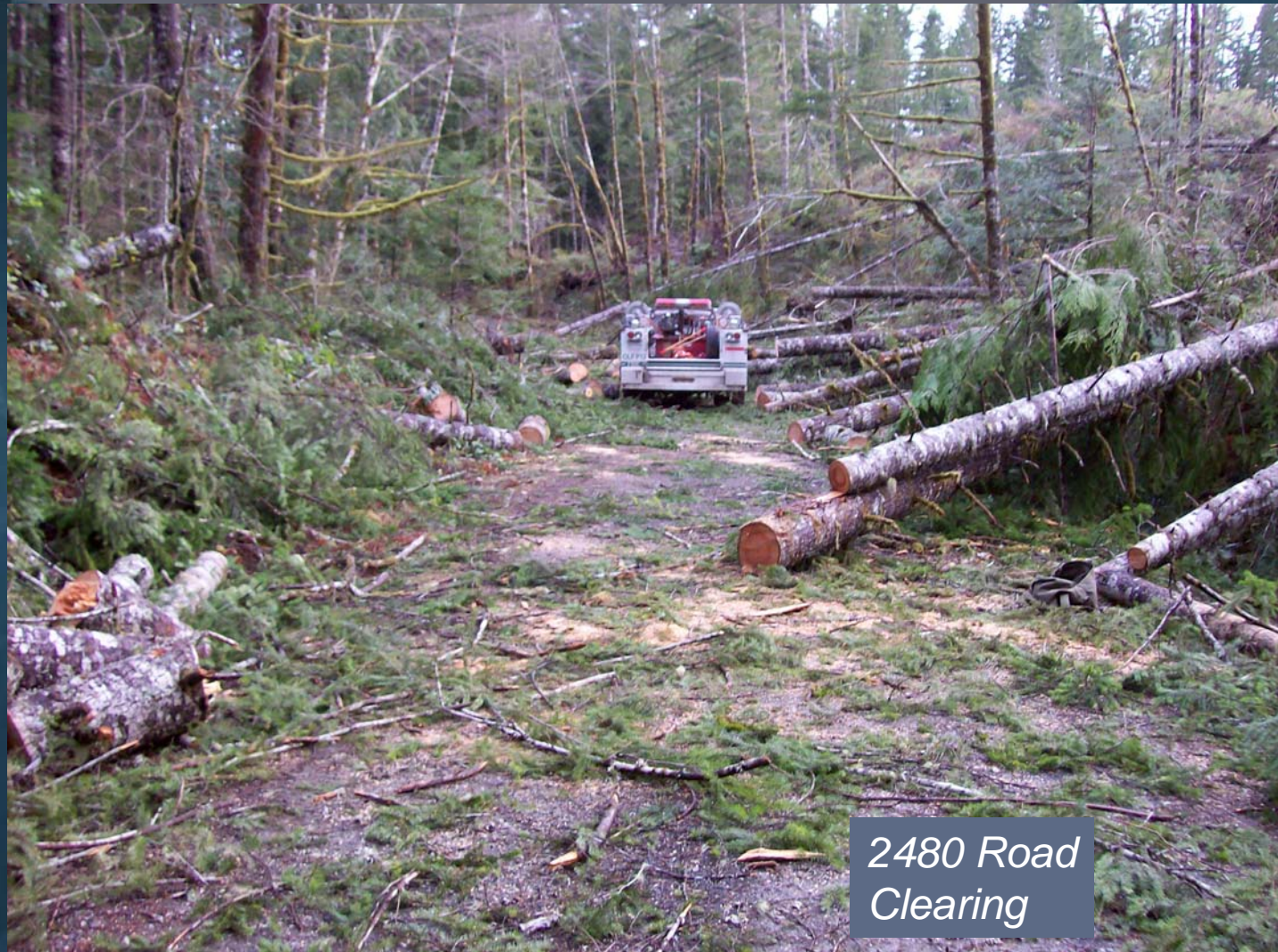
2480 Road Clearing