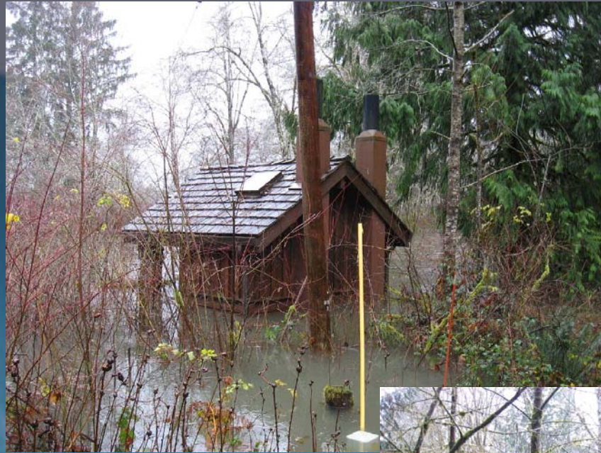
Flooded: Gatton Creek Campground