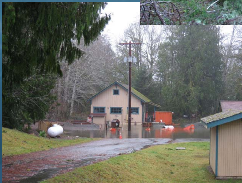
Tree on Forest Service House, Quinault Compound