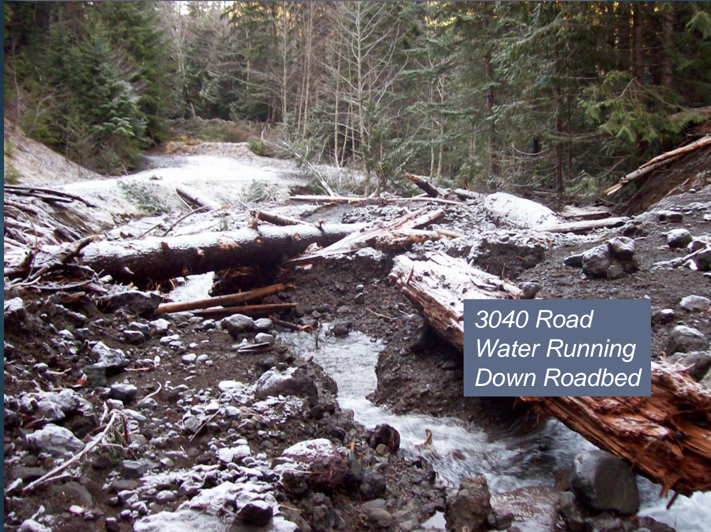
3040 Road Water Running Down Roadbed