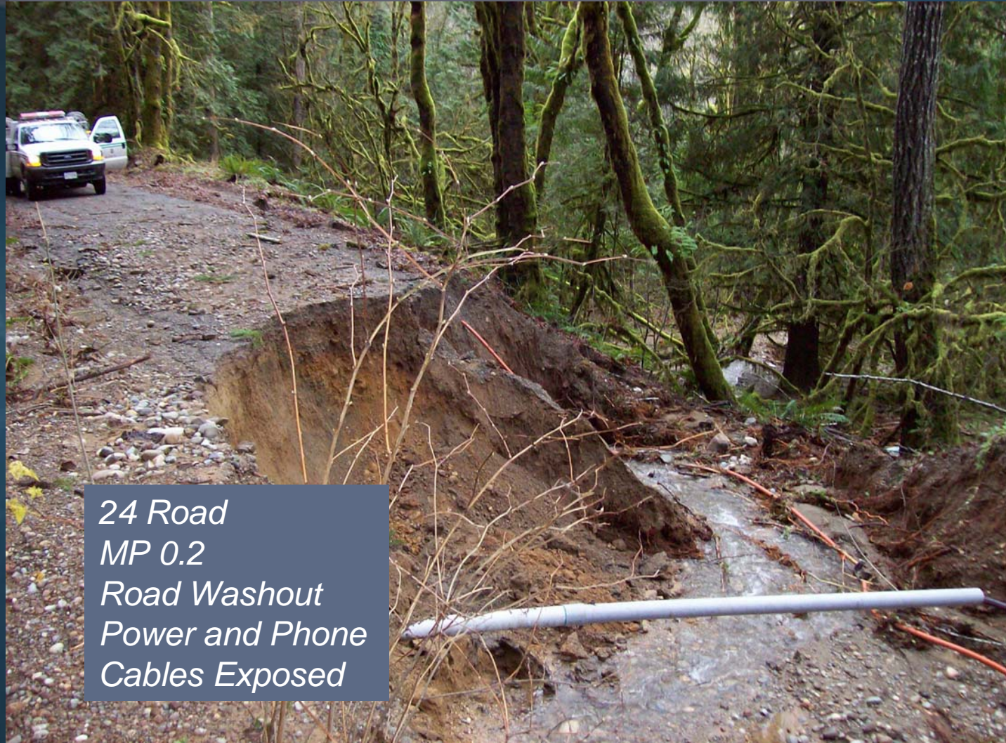
24 Road MP 0.2 Road Washout Power and Phone Cables Exposed