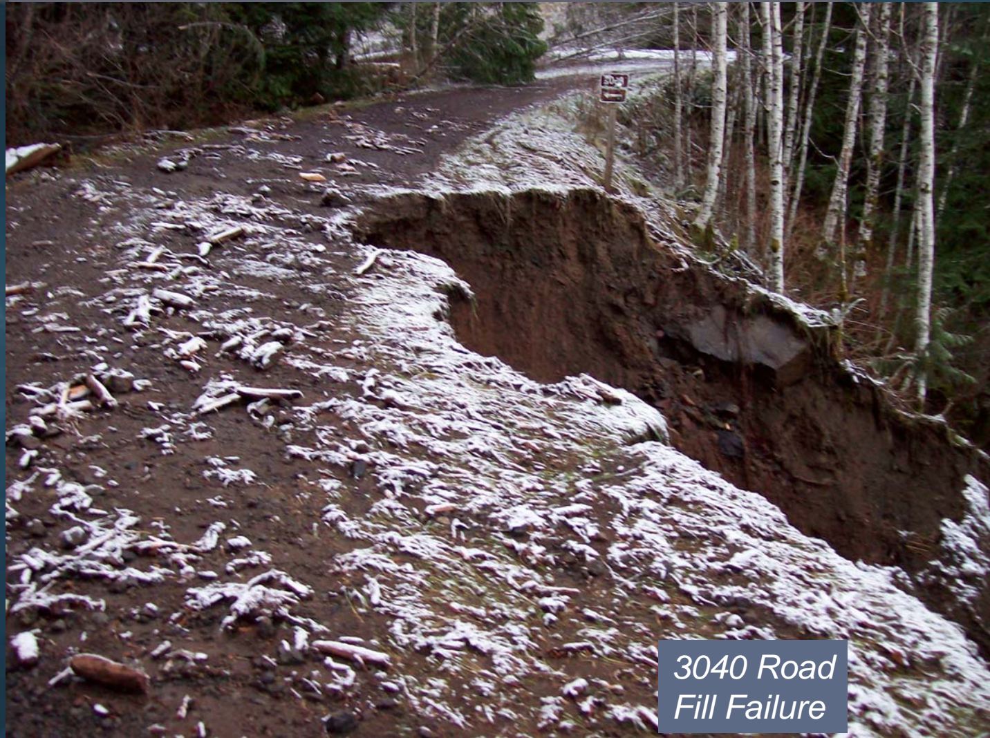
3040 Road Fill Failure