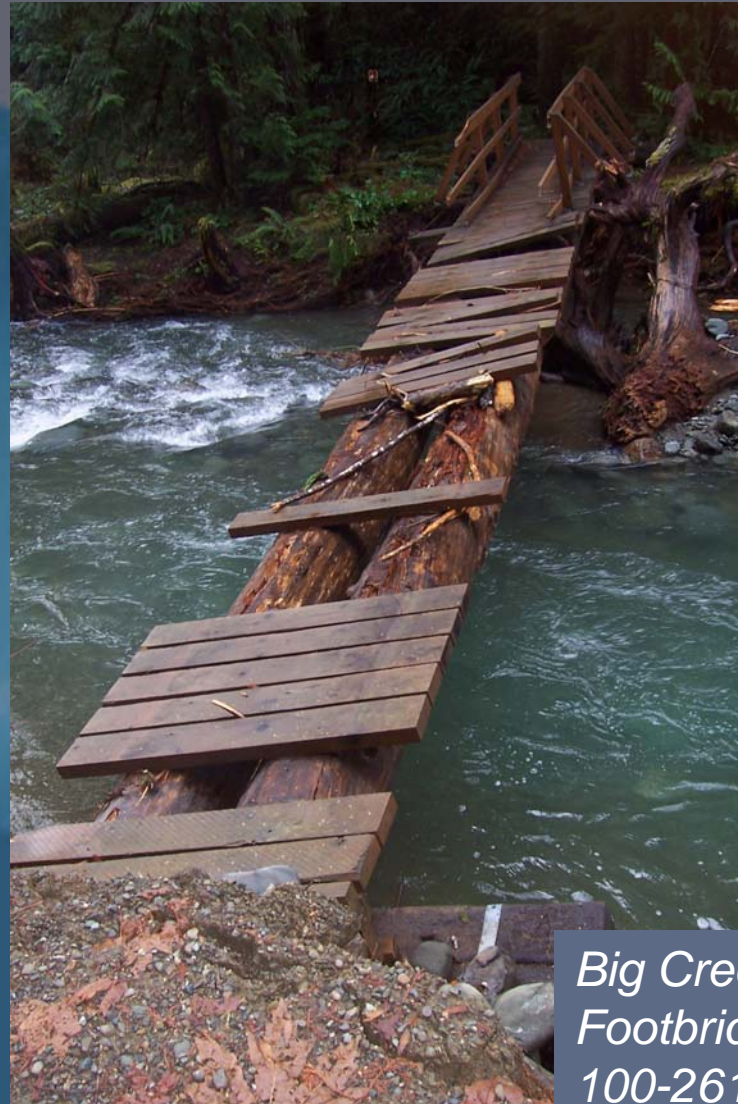
Big Creek Footbridge 100-2618