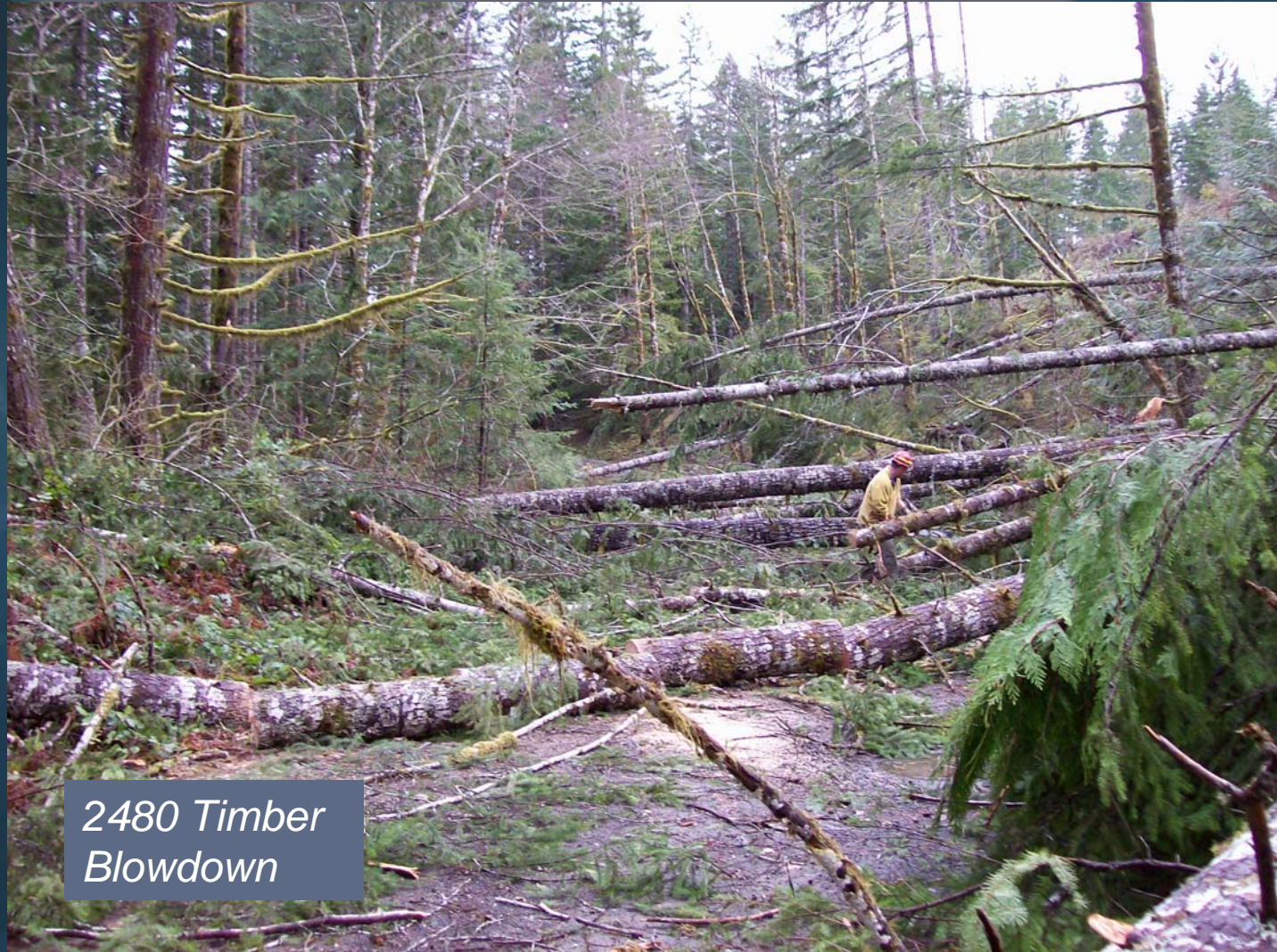
2480 Timber Blowdown