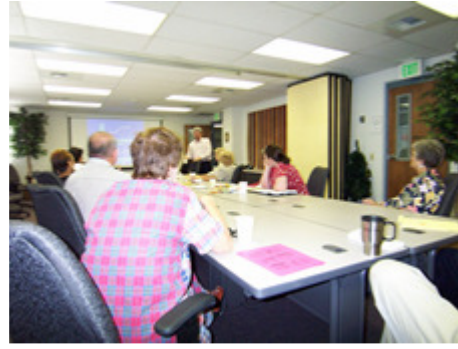
June 19, 2006: 2 nd Quarter CCHILL Meeting- Denver, Colorado