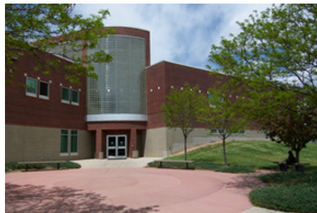
May 10, 2006: Aims Community College (Affiliate member) Training - Greeley, Colorado