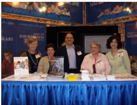
June 23-28, 2006: American Library Association Annual Conference Exhibit – New Orleans, Louisiana