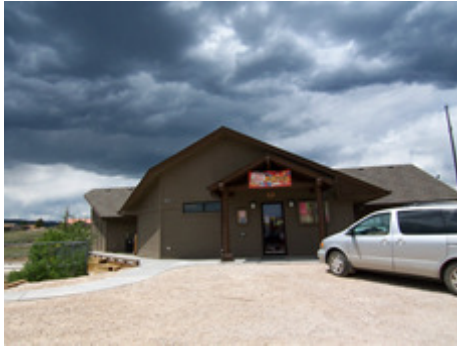
June 7, 2006: Consumer Health Resources - Red Feather Lakes Community Library (Affiliate member) Red Feather Lakes, Colorado