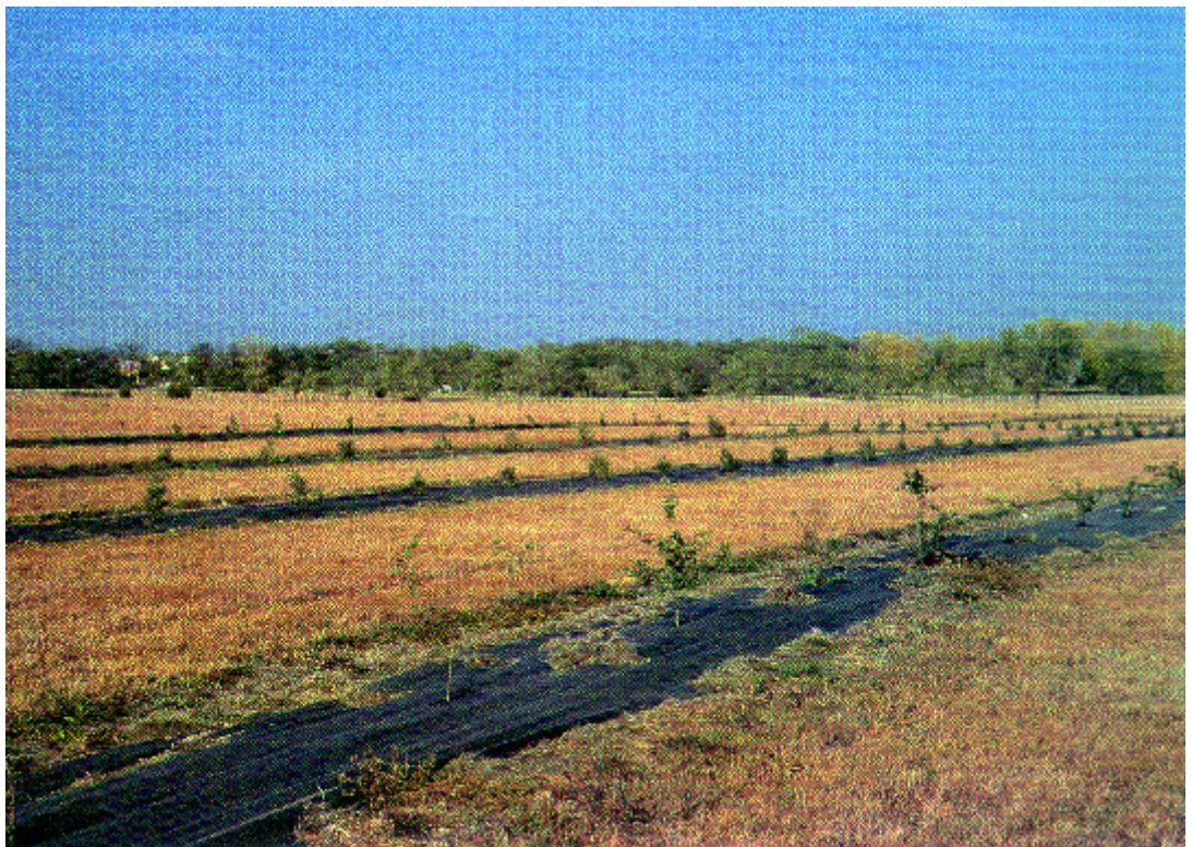
Landscape fabrics reduce the labor required for weed control and offer many advantages in dry or remote areas where other measures are impractical.

Mechanical cultivation two or three times during the growing season eradicates most annual and biennial weeds and suppresses perennial vegetation. Shallow cultivation (no more than two to four inches) when weeds are small is best since deep cultivation near the trees can destroy many feeder roots and waste soil moisture. Each cultivation loosens and dries the soil and prunes small feeder roots in the tillage zone. Care must be taken to avoid over cultivation and mechanical injury to trunks and limbs as the trees grow.