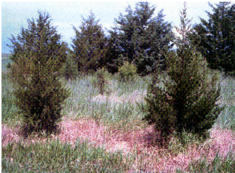
Sod forming grasses compete for moisture and nutrients and reduce tree growth rates. In older windbreaks contact herbicides are an effective control method.

A unique opportunity occurs when fencerows containing trees and shrubs are properly managed. Careful selective