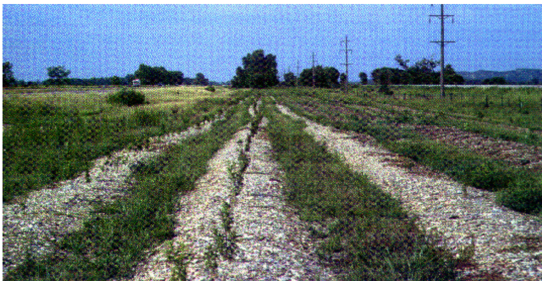
Wood chip mulches are an attractive alternative to cultivation or herbicides and provide good soil moisture conservation and weed control.

Livestock benefit from the protection provided by a windbreak, however, grazing livestock within the windbreak will cause serious damage to your investment. Damage from trampling, browsing, and breakage leads to slower growth, weakened trees, and premature death. When