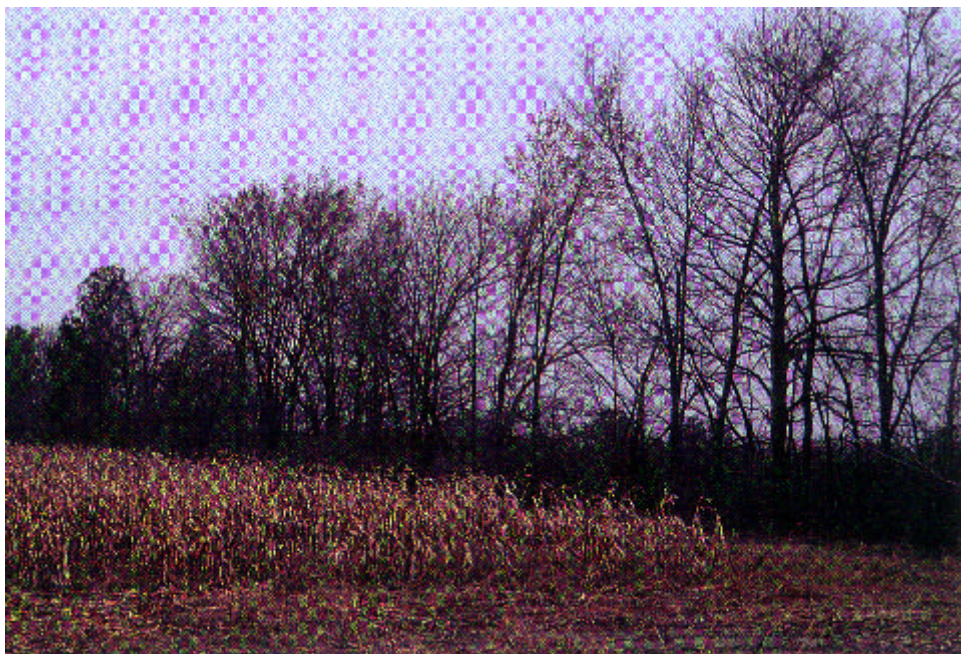
In many areas fencerows have grown up with native trees and shrubs. Instead of removing these trees they can be managed to provide excellent windbreaks.

cutting within a fencerow can convert it to an effective field windbreak. Most native species of trees and shrubs are suitable for retention in a fencerow that is being modified into a windbreak. When making selections, favor species that are long-lived, disease resistant, breakage resistant, and have dense crown development, such as oaks, ashes, hard maples, and eastern redcedar. If possible, trees should be left every 10 to 16 feet and in a relatively straight line. If gaps occur, plant the open spaces with small saplings of the most common species in the row. You may also try planting nuts or seeds of desired species. It is a good idea to plant more trees than are needed, especially if you try direct seeding, since survival rates may be low due to the high degree of competition that is present. This is especially true in dry regions and in these circumstances supplemental water and weed control may be needed for the first several years. With a little imagination and common sense, a relatively low value fencerow can be converted to a valuable windbreak investment.