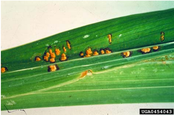
Development of Black Telia around Pustules: U. transversalis fruiting bodies: uredinia (orange) containing urediniospores and telia (black). Photo