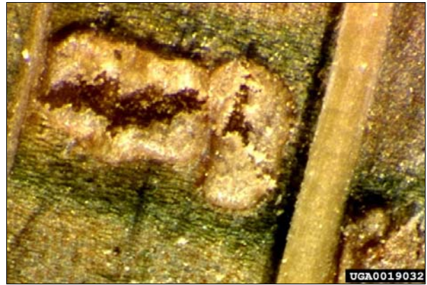
Erupting sorus on gladiolus leaf.