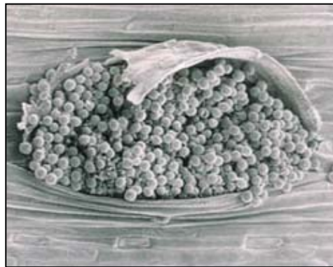
Electron micrograph of a rust sorus.