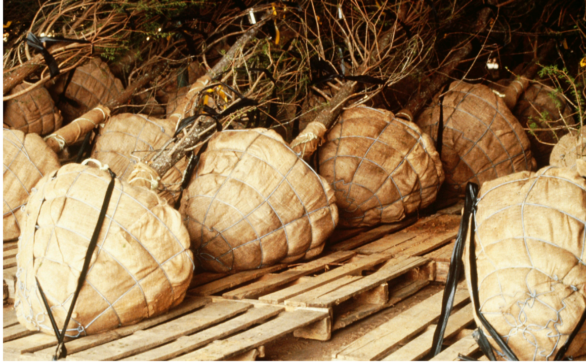
Figure 7 —Prior to being loaded onto pallets for interstate shipping, these balled-and-burlapped trees were immersed in a tank of insecticidal solution to above the soil line to kill any hidden fire ants.

Locate the immersion tank in a well-ventilated place. The location should be covered if possible. Do not remove burlap wrap or plastic containers with drain holes prior to immersion. Immerse soil balls and containers, singly or in groups so that soil is completely covered by the insecticidal solution. Plants must remain in the solution until bubbling ceases. After removal from dipping tank, plants may be placed on a drain board until adequately drained. Thorough saturation of the plant balls or containers with the insecticide solution is essential.