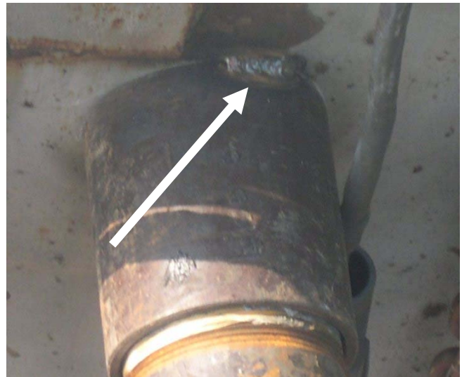
Figure 5. Tack weld and connection being welded to tank 4

explode. Then vapor inside tank 2 ignited followed by the explosion of the tank.