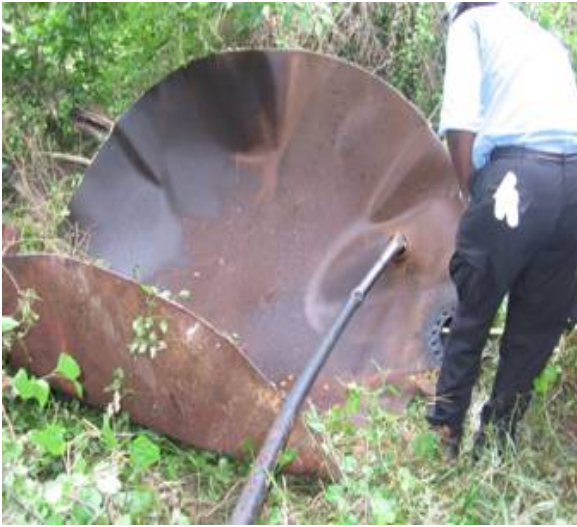
Figure 3. Tank 2 lid