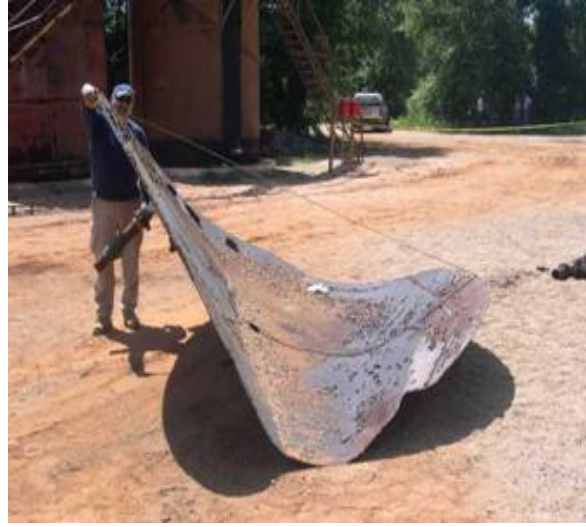
Figure 4. Tank 3 lid