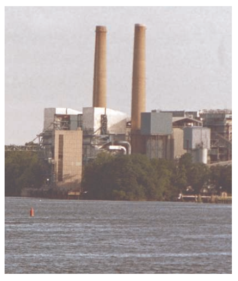
An uncertain future challenges water planners.

The stationarity assumption has long been compromised by human disturbances in river basins. Flood risk, water supply, and water quality are affected by water infrastructure, channel modifications, drainage works, and land-cover and land-use change. Two other (sometimes indistinguishable) challenges to stationarity have been externally forced, natural climate changes and low-frequency, internal variability (e.g., the Atlantic multidecadal oscillation) enhanced by the slow dynamics of the oceans and ice sheets (2, 3). Planners have tools to adjust their analyses for known human disturbances within river basins, and justifiably or not, they generally have considered natural change and variability to be sufficiently small to allow stationarity-based design.