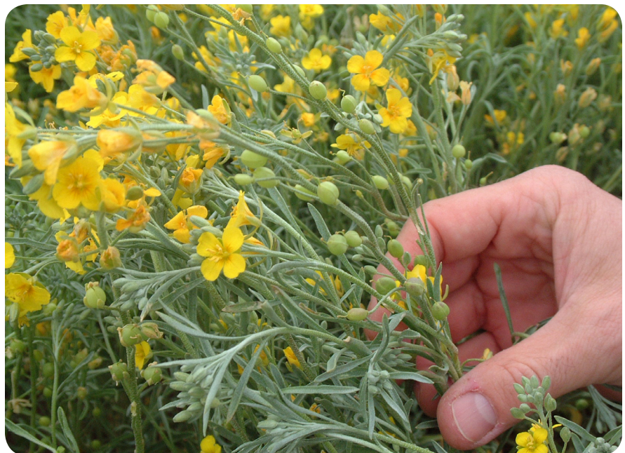
Right: The lesquerella flower.