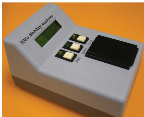
Sperm Mobility Analyzer, Animal Reproduction Systems, Chino, CA

A SPERM MOBILITY ANALYZER IS NOW AVAILABLE COMMERCIALY TO ASSESS FERTILITY OF ROOSTERS ON THE FARM