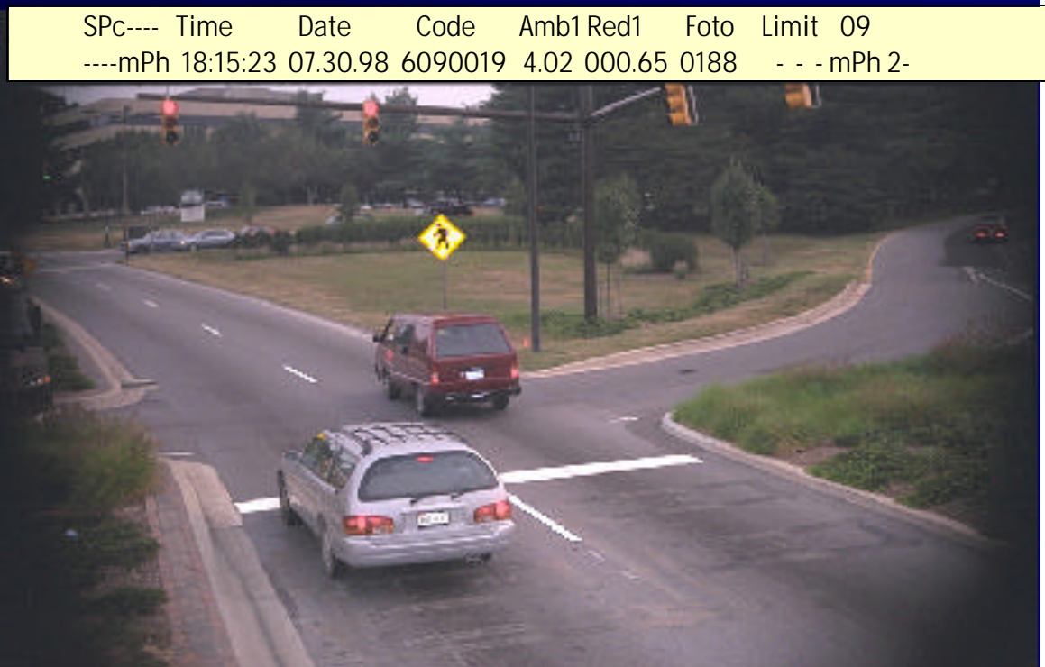
Figure 2. First Picture Taken By Automated Enforcement System