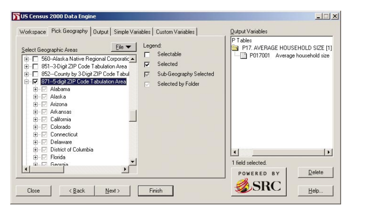
Figure 4. Powerful Software on SF 1 DVDs and CDs Lets You Control Retrieval and Output