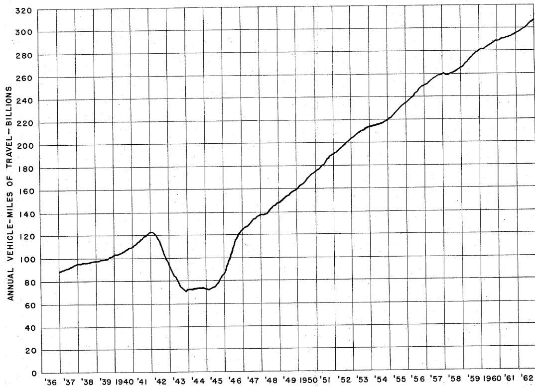
FIGURE 2--TRAVEL ON MAIN RURAL ROADS BY 12-MONTH PERIODS ENDING EACH MONTH, IN VEHICLE-MILES