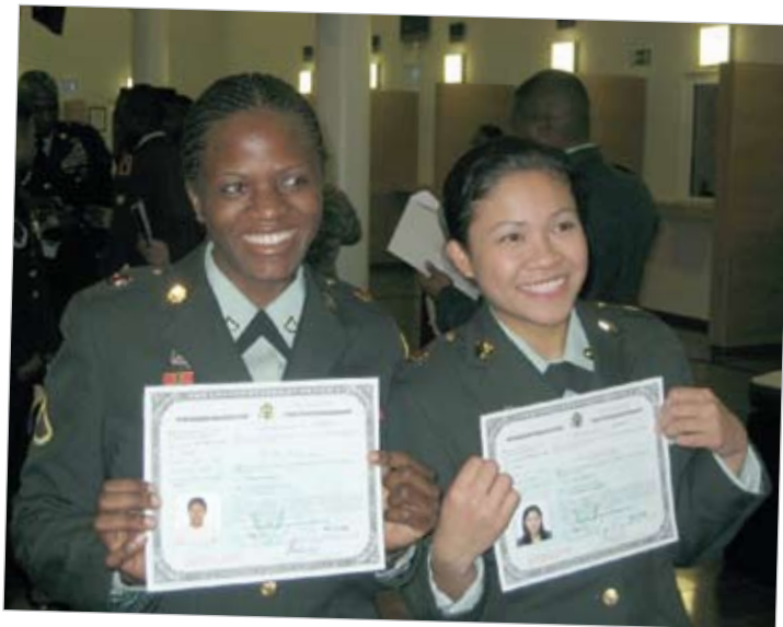
U.S. military naturalization ceremony, Fort Bliss, TX

The Policy Coordination and Special Programs Branch is responsible for developing and managing programs, regulations, products, policies and coordinating activities related to Employment Authorization and Advance Parole, Fee Waivers, Requests for Evidence and acts as the general liaison with the Office of the USCIS Executive Secretariat, the USCIS Office of Chief Counsel, Department of Homeland Security headquarters and other department entities.