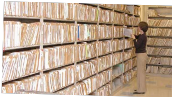
Records file room

The Records Division was restructured in January 2007 to realign with the mission and goals of USCIS and to better facilitate the records management functions within the organization. The Records Division is comprised of six branches. Each of the branches has flourished under the new realigned structure.