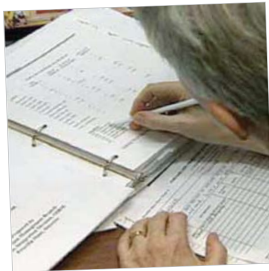
OCFO conducted a comprehensive fee review

Based upon their commitment to public service, dedication to the mission and comprehensive knowledge of the federal government's financial management best practices, Office of the Chief Financial Officer (OCFO) is an invaluable asset to USCIS and Department of Homeland Security. OCFO will continue to make progress along its journey to transform USCIS' Financial Management line of business into a model of excellence.