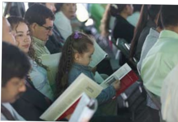
Newly naturalized citizens review Citizen's Almanac