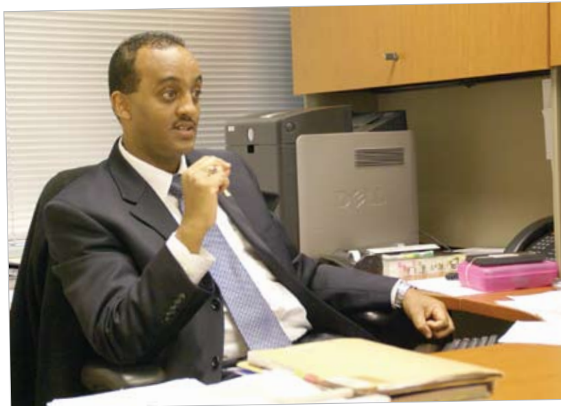
USCIS officer conducts reasonable fear of persecution screening

TRAQ reviews sensitive asylum cases and provides legal and policy guidance to ensure consistency within a constantly evolving legal framework and identifies areas and issues requiring additional training. In addition, TRAQ's Country of Origin Information Research Section conducts research on unique cases, disseminates country conditions information and ensures the appropriate use in the asylum decision-making process. As a key measure to ensure quality throughout the Asylum Program, the Asylum Division requires 100 percent Supervisory Asylum Officer review of all asylum decisions, regular supervisory observation of interviews and weekly field training. TRAQ supports these field office efforts by providing guidance and advice to supervisors and quality assurance/training officers in the field.