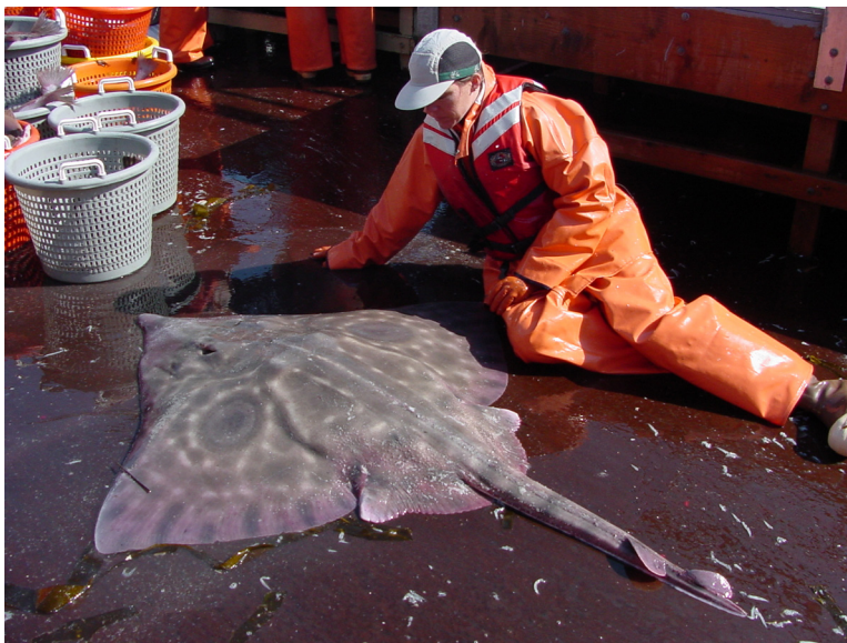
Figure 1. Raja binoculata (big skate).

The fish family Rajidae, commonly known as the skates, includes about 280 species of primarily benthic fishes found throughout the world's oceans from tropical to cold temperate latitudes. The fishes of Alaska (Mecklenburg et al., 2002), the most recent inventory of Alaska's fishes, lists 12 species of skates known to occur in the Gulf of Alaska, Aleutian Islands, and Bering Sea from the intertidal zone to depths of over 1500 m, and at least 2 other species have been discovered in the region since the publication of that volume as described in Bathyraja mariposa: a new species of skate (Rajidae: Arhynchobatinae) from the Aleutian Islands (Stevenson et al., 2004a) and New records of two deep-water skate species from the Bering Sea (Stevenson and Orr, submitted). Many of these species are widely distributed, with ranges extending south along the coast of North America as well as into the western North Pacific, Sea of Okhotsk, and Sea of Japan.