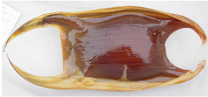
Figure 5. Bathyraja parmifera (Alaska skate) egg case from the southeastern Bering Sea.

the tools and training provided observers with an effective means of identifying skates to the species level, and that the additional time commitment that would be required to complete these identifications would be minimal.