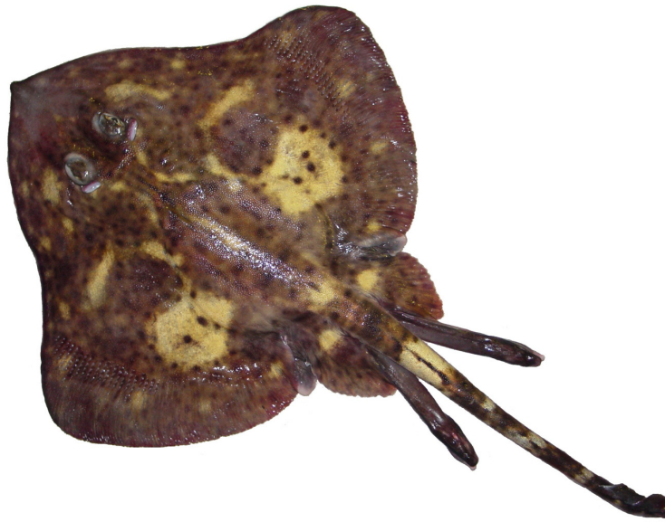
Figure 4. Bathyraja mariposa (Butterfly skate).

the pattern of denticles on the dorsal surface, and vertebral counts, all of which confirmed this as a species unknown to science. Since its discovery, more than 20 specimens of this species have been collected on RACE surveys. Furthermore, another new skate species has recently been recognized in the Aleutian Islands, and a description of that species is currently under way. Information on the species in the poster Bathyraja parmifera ( Rajidae: Arhynchobatinae ), and related species, including preliminary data on a new species from the Aleutian Islands (Orr et al., 2004), was presented at the 2004 Western Groundfish Conference and 2004 Annual Meeting of the American Society of Ichthyologists and Herpetologists. Additionally, at least one species previously unknown from Alaska has recently been collected on RACE surveys in the Bering Sea. In total, AFSC research has added three species to the list of skates known from Alaskan waters, and more are sure to come.