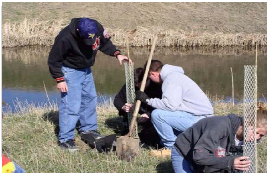
Earth Team volunteers place protective tubing around each tree and shrub to prevent damage from wildlife browsing.