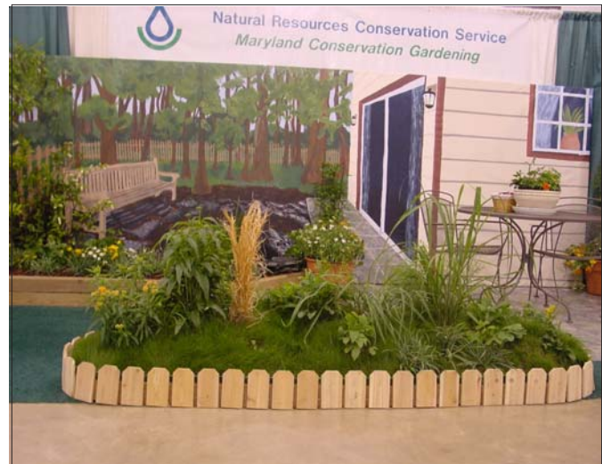
Realistic backyard created for NRCS display.

All the students enjoyed participating in the project and exercising their art talents as well as learning about NRCS' conservation practices and becoming Earth Team volunteers. NRCS