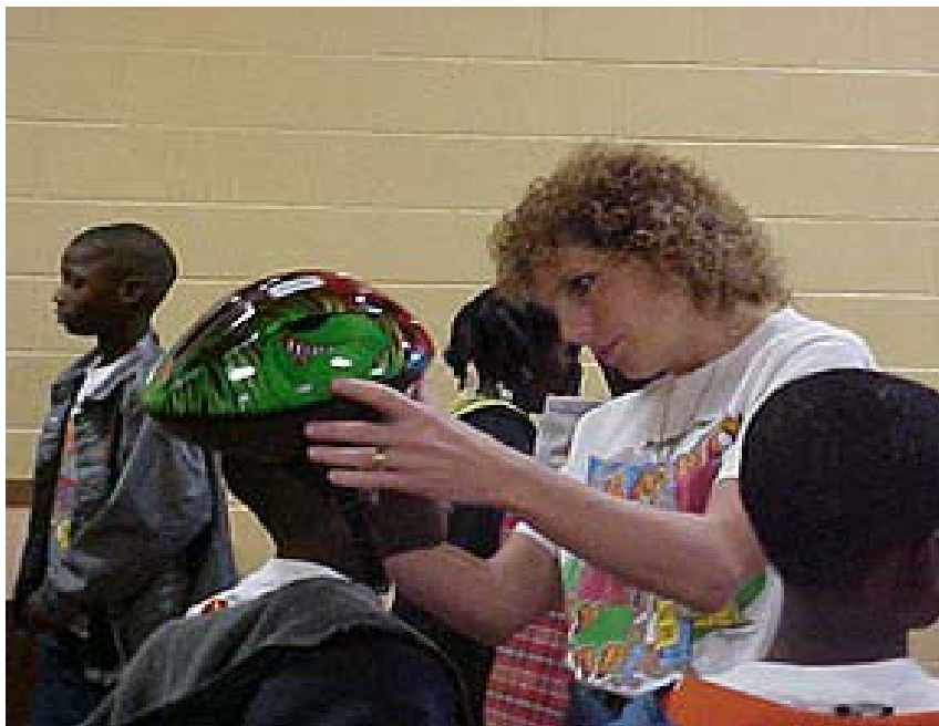
An Earth Team Volunteer, also an Associate Degree Nurse (ADN) instructor, fits a bicycle helmet on a student at Nix Elementary during Farm Safety Day Camp.