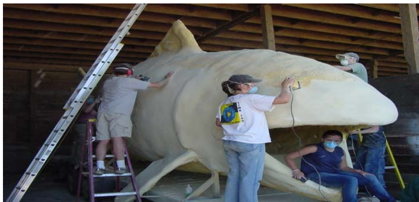
Volunteers work hard sanding down rough spray-foam finish.

covered with fiberglass, which again had to be sanded to remove hairs and slivers. Once the outside was completely fiberglassed, volunteers began on the inside, which also had to be fiberglassed. Because no one knew anything about fiberglass, this process took several tries. After finally getting the fiberglass to stick to the inside, it was sanded and prepared for paint. The final coats of paint went on the outside in late September. The inside is a mural of a watershed with wildlife and flora, including the life cycle of a salmon. The volunteers have been working on painting the inside since January, and it is still being worked on. This whale of a task has had the help of six high school volunteers, two college student volunteers, 10 adult volunteers, and six staff members.