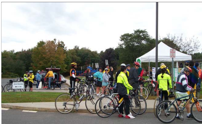
Bikers prepare to start in the first annual Connecticut Tour des Farms.

Riders cruised along the Connecticut River and viewed old tobacco sheds and the rich, floodplain soils that have supported its inhabitants for centuries. The ride also provided the oppor-