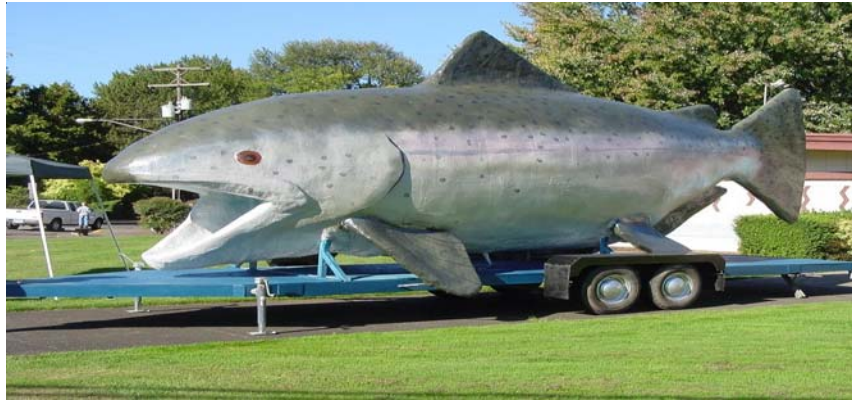
"Claudia Chinook" in all her glory as she waits to be transported.