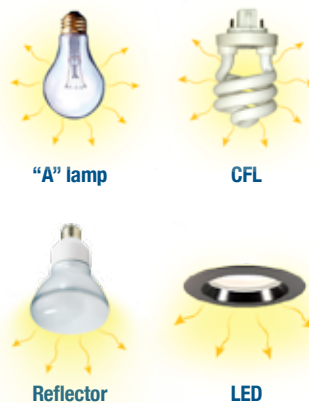
Table 1: Examples of Recessed Downlight Performance Using Different Light Sources

The light output of a traditional recessed downlight is a function of the lumens produced by the lamp and the luminaire (fixture) efficiency. Reflector-style lamps are specially shaped and coated to emit light in a defined cone, while “A” style incandescent lamps and CFLs emit light in all directions, leading to significant light loss unless the luminaire is designed with internal reflectors. Downlights using non-reflector lamps are typically only 50% to 60% efficient, meaning about half the light produced by the lamp is wasted inside the fixture. Recently, LED downlights have come on the market. Table 1 provides examples of performance data for residential recessed downlight using several different light sources, including two LED products. These data should not be used to generalize the performance of fixture types, but are provided as examples.