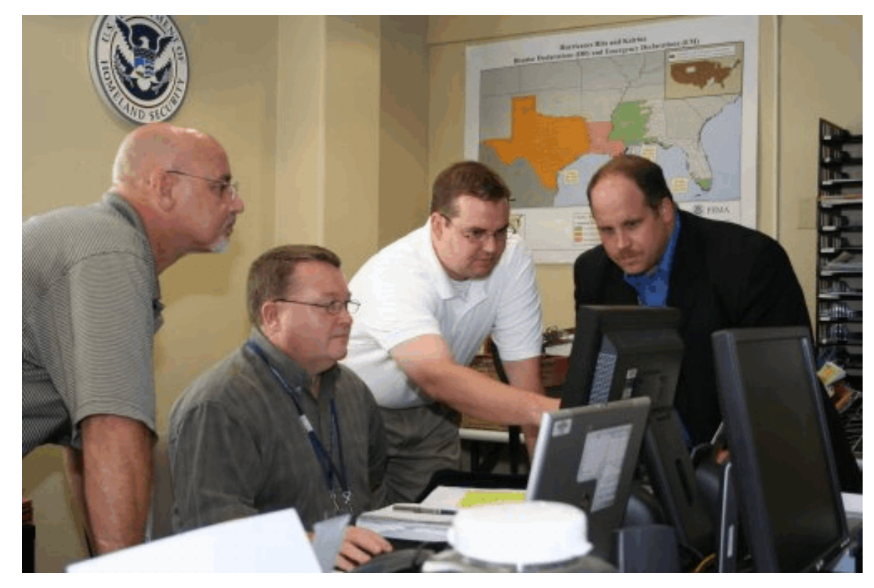
Figure 3 - Federal Agents Confer at Joint Command Center, Baton Rouge