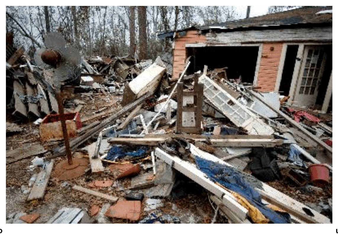
Figure 8 - Home in Waveland, Mississippi Destroyed by Hurricane Katrina

In response to the devastation that last year's hurricanes caused for homeowners throughout the Gulf Coast Region (see Figure 8 below), Congress has authorized more than $15 billion in CDBG grants for the states affected by Hurricanes Katrina and Rita. The bulk of that money will go to Louisiana and Mississippi.