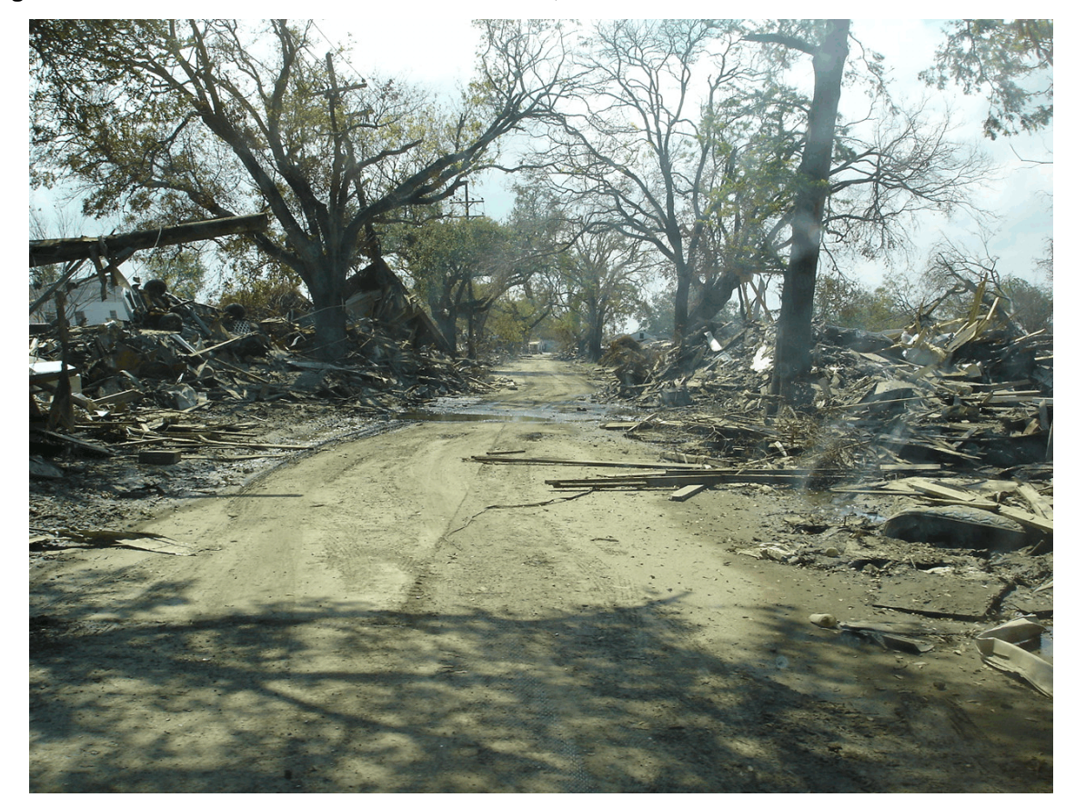
Figure 7 - Road in the Ninth Ward of New Orleans, Cleared of Debris After Hurricane Katrina