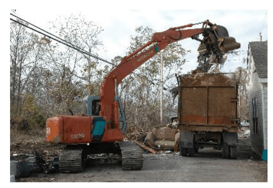
Figure 1 - Hydraulic Excavator Filling Debris-Removal Truck in Pass Christian, Mississippi

is informed that funds are being made available for recovery and reconstruction of the affected areas. Even in the initial phases of recovery, such as debris removal (see Figure 1 below), criminals seek to develop opportunities for fraud. Just last month, for example, four individuals were indicted in the Southern District of Mississippi for conspiracy to defraud the United States in connection with the creation and submission of fraudulent debris removal load slips in the amount of $716,677. In this case, the load tickets were submitted even though the trucks at issue were not being used on the roadways or at the dumps indicated. In another case, the Task Force saw similar conduct when another debris hauler submitted falsified load tickets for trucks that were actually in another state at the time. Public corruption is often associated with procurement fraud, as schemes by contractors to submit false or fraudulent invoices or documentation often succeed only because they bribe or compromise the public employees and officials whose oversight is essential for the conduct of the program.