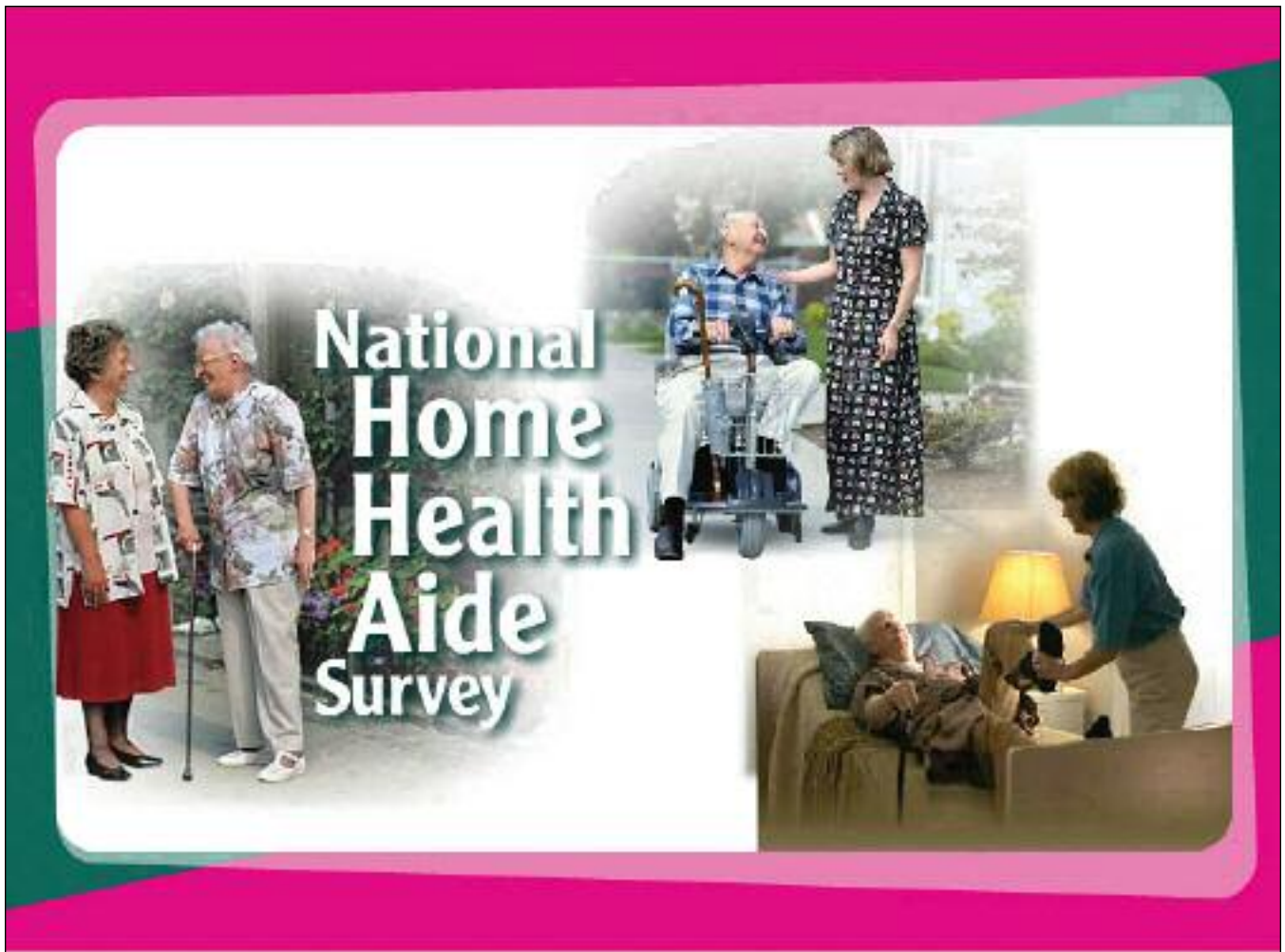
Music Plays. Photo montage of home health aides appears. National Home Health Aide Survey logo appears.