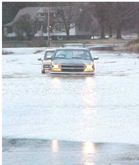
Flooding on Flannigan Road near Potlatch, ID. Luckily these drivers were safe, but driving through at least 2 feet of water can sweep most vehicles away! Please, avoid water covered roadways.