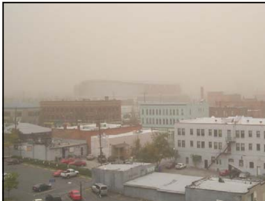
Dust in the skies over Spokane. These pictures were taken near the Spokane Arena. The one on the left was taken around 2:30 pm, while the one on the right was taken just 2 hours later around 4:30 pm.