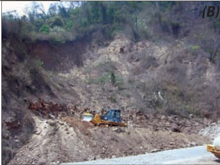
Figure 6. Landslides along the road to Jinotega in the La Fundadora study area showing broad scale of response. (A) A failure less than 1 m deep and about 40 m 2 in area. Material from the failure traveled approximately 20 m over an open hillslope. (B) An approximately 5-m-deep failure into weathered material. This landslide was approximately 3000 m 2 in area and traveled at least 100 m down a channel.