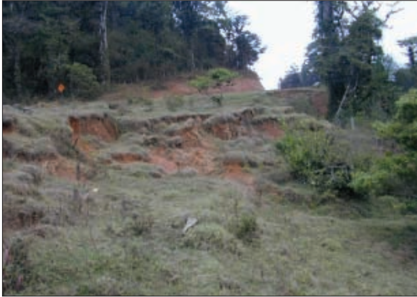
Figure 7. Deep-seated, slow-moving earth flow on road to Jinotega. The road crossing this feature was disrupted in many places and was under extensive repair.

graphs and field reconnaissance (plate 5). Most landslides occurred on steeper ( 20^{\circ} to 27^{\circ} ) hillslopes underlain by basalt and andesite of the Coyal Superior Group (unit Tpcb); this unit also showed the highest susceptibility (table 1). Undifferentiated Quaternary-age alluvium and colluvium also showed a similar susceptibility index. Because all of the landslides mapped in the undifferentiated Quaternary unit occurred on hillslopes we assume that they initiated within hillslope-mantling colluvium. The ignimbrite and tuff of the Coyal Superior Group (unit Tpci), and the dacite ignimbrite and tuff (unit Tmcd), the andesite ignimbrite [unit Tmcd(A)], and agglomerate and/or andesite (unit Tmca) of the Coyal Inferior Group also showed some susceptibility to landsliding (table 1). The breccia and agglomerate [unit Tmcd(Ag)] of the Coyal Inferior Groups showed the lowest susceptibility (table 1).