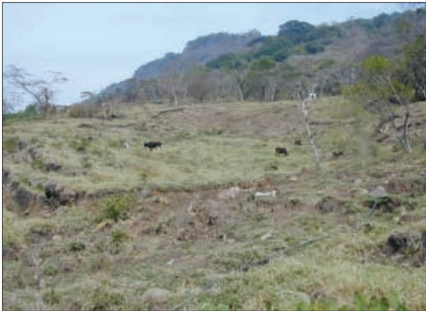
Figure 11. View up slope of earth flow at San Simón de Palcila. Note the hummocky topography, large scarps and cracks in the foreground, and headscarp behind the cows.

small as a few square meters up to about 25,000 m 2 . During the field reconnaissance we observed that smaller scars could be less than 0.5 m in depth, and we mapped debris flows that traveled as little as a few tens of meters down-slope. Because most debris flows traveled into