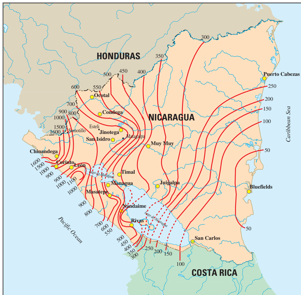
Figure 2. Map of rainfall isohyets (in mm) from Hurricane Mitch (21 to 31 October 1998). The principal meteorological stations in Nicaragua are shown by yellow dots. Map adapted from INETER (1998).

tions measured at 14 of 16 gauges located throughout Nicaragua were significantly greater during Hurricane Mitch than those measured during the 10 other hurricanes and tropical storms that have occurred since 1971 (INETER, 1998). Rainfall accumulations measured during the 10-day period that Hurricane Mitch impacted Nicaragua varied between about 50 mm in the southeast portion of the country adjacent to the Caribbean coast, to more than 1600 mm at the northwest corner of the country adjacent to Honduras (fig. 2). These totals ranged between minus 72% of the normal rainfall for the last 10 days of October at the Bluefields gauge located in the southeast of the country (the normal rate being greater than that received during Hurricane Mitch) to 2793% of the normal rainfall for the last 10 days of October at the San Isidro gauge (INETER, 1998).