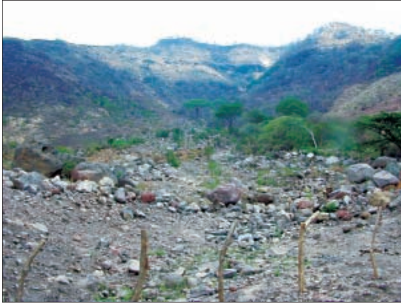
Figure 4. Source area and deposits of debris flow near La Caña.

During field reconnaissance we observed that the landslide scars most commonly occurred in areas of weathered and/or hydrothermally altered materials. In addition, the depth of scars appeared to be controlled by the depth of weathered mantle; very shallow landslides occurred where the weathered mantle was thin, and scars up to several meters deep developed in areas where the weathered mantle was several meters thick.