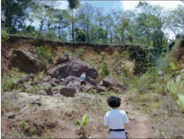
Figure 8. Headscarp of landslide that produced a debris flow that traveled through the village of San Francisco, killing one person. Note deep weathering profile in approximately 5-m-high head scarp.

Although Río Molino Norte shows evidence of significant Hurricane Mitch-related flooding and transport of material in the reach north of Matagalpa, we could not discern these effects in the channel through Matagalpa from aerial photographs.