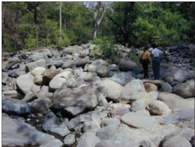
Figure 3. Boulder deposit at Quebrada Grande in the El Sauce/San Nicolas study area.

The great majority (3664) of mapped landslides occurred within materials that mantle hillslopes underlain by the dacite of the Coyal Inferior Group (unit Tmcd, plate 2). We found that the dacite of unit Tmcd was nearly four times more