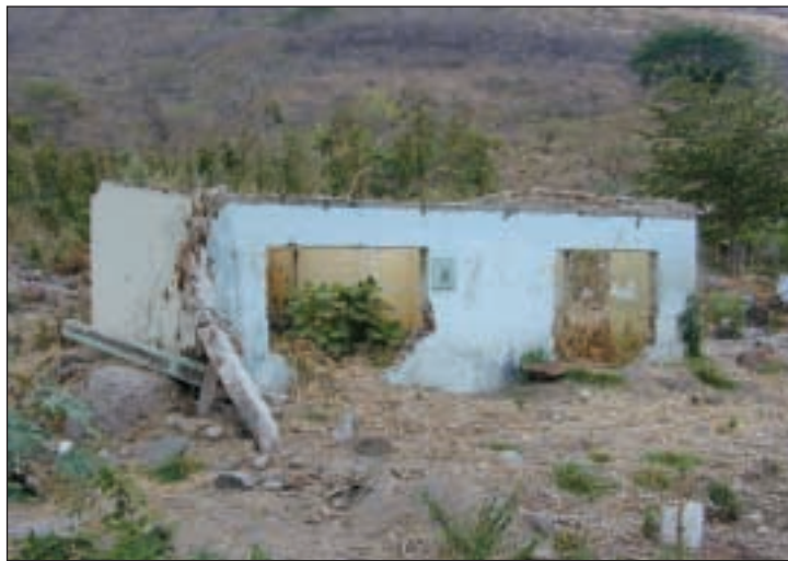
Figure 5. Structures destroyed by debris flows behind hospital at La Trinidad.

Viejo and Río La Trinidad are located beyond the coverage of the aerial photographs, it is not known if these effects are the result of landsliding or flooding. Quebrada Seca drains the area that experienced extensive debris-flow activity behind the village of San Francisco, but due to their scale, it was not possible to determine from the aerial photographs the extent of the debris-flow paths.