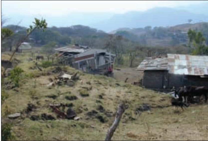
Figure 10. Toe of the earth flow at San Simón de Palcila. House on the left was destroyed by movement on the earth flow. An active lobe of the earth flow is impinging on the house at the right.