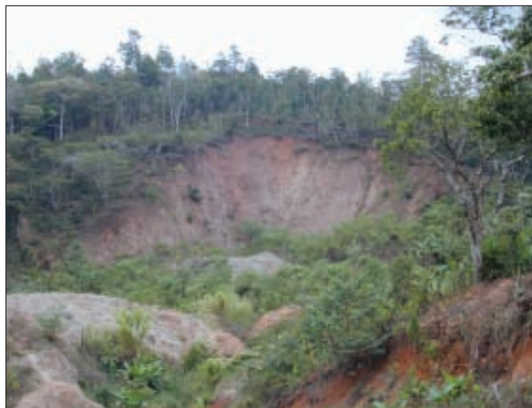
Figure 9. Headscarp (approximately 8 m high) of landslide in deeply weathered materials in northern Matagalpa study area.

We mapped 457 landslide initiation locations in the 150-km 2 area (plate 6). The landslides vary considerably in size; scars range in area from as