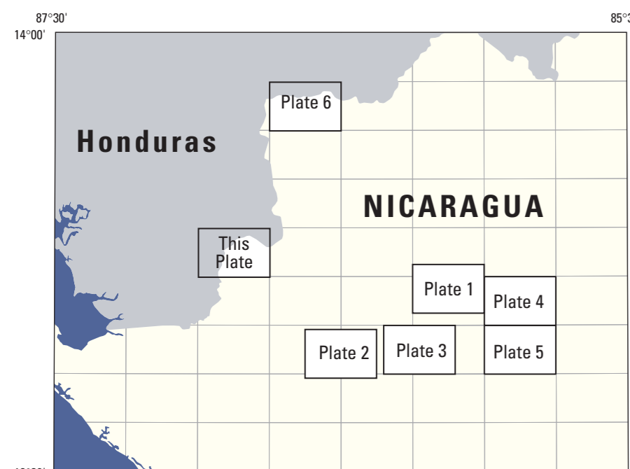
Location of other plates in this study.