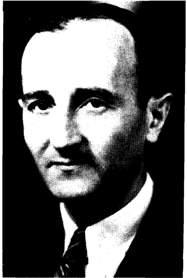
William F. Friedman in the early 1930s.

"...I would be extremely anxious to have you come for several reasons," he wrote, "but in particular, if you want to see some interesting stuff along R [Russian] lines, now is the time. Also I would like to see you because I really miss our former contacts of a personal nature."