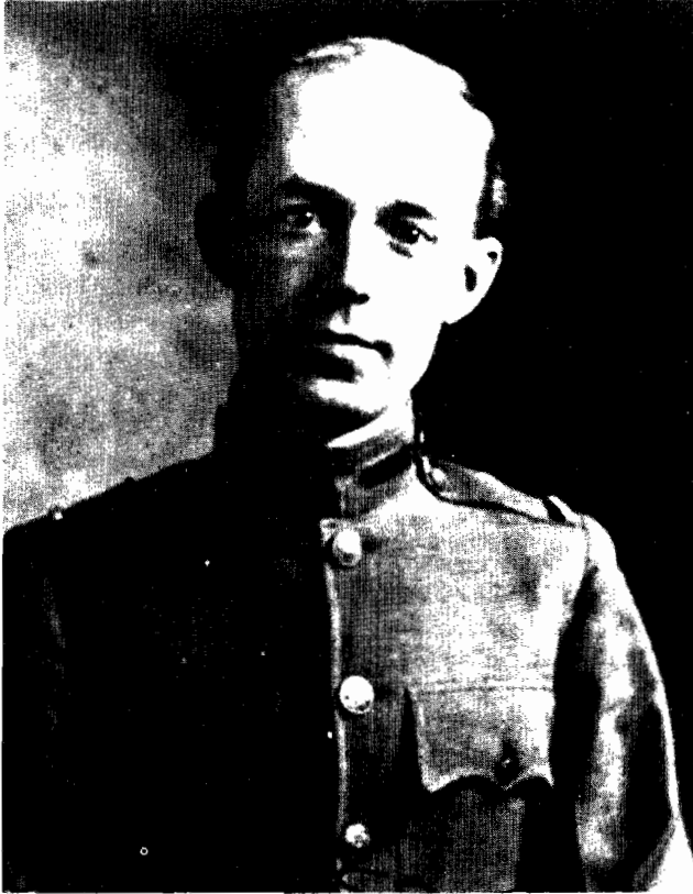
Lieutenant Yardley in 1917 or early 1918.

expanded, Yardley's organization moved several times to various locations in Northwest Washington, D.C. M.I.8 was responsible for examining and, if possible, reading all secret communications coming to the attention of the War, Navy, State, and Justice Departments, Postal Censorship, and other official and semi-official agencies. In addition, Yardley began a course of instruction in cryptology for new people coming into the organization.