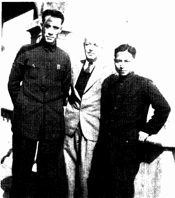
In Chungking, with two of his students.