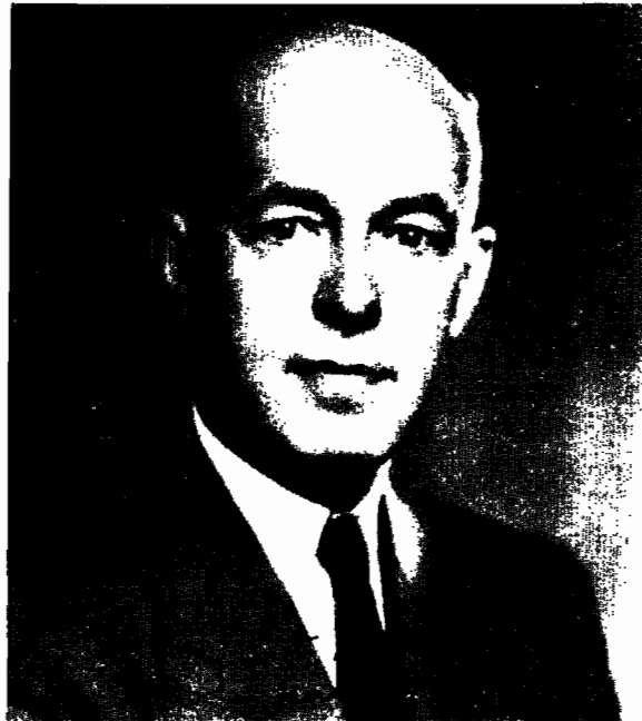
In the 1930s, before leaving for China.