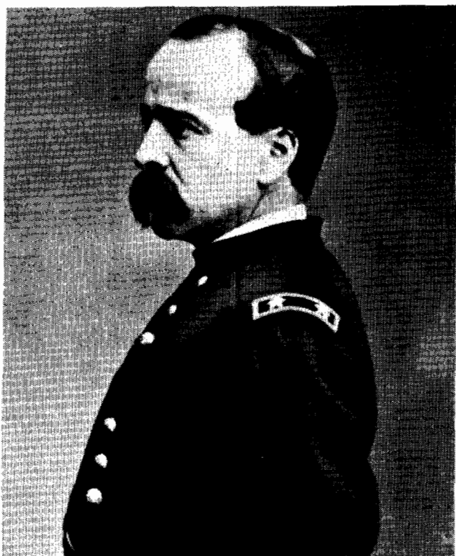
Maj. Gen. Daniel Butterfield

Against staff advice favoring an attack downriver, below the point of Burnside's main thrust, Hooker decided to move against Lee's left (upriver) wing. He would send his cavalry far around the Confederate left to break the Richmond-Fredericksburg railroad. If both halves of the scheme worked, or even if only the first half worked, he might, by getting in Lee's rear, bag virtually the whole Army of Northern Virginia.