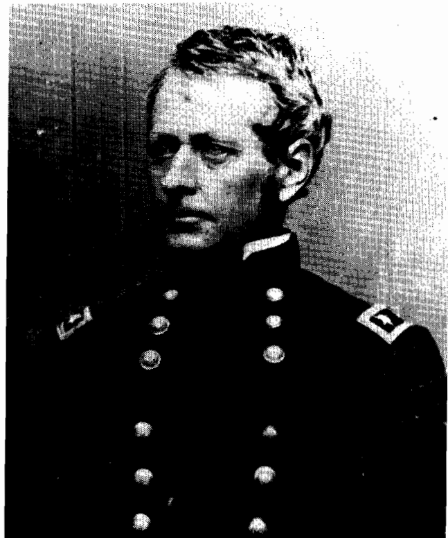
Maj. Gen. Joseph Hooker