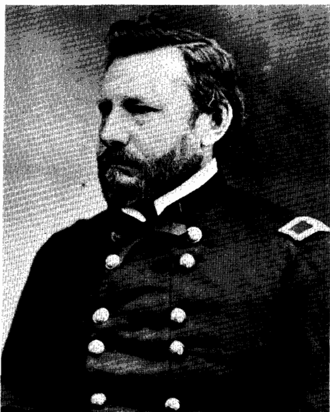
Col. Albert J. Myer