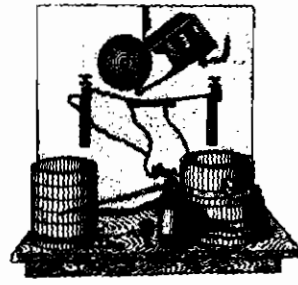
Popov's Lightning Detector (1894)