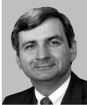
Sen. Jack Reed of Cranston Democrat—Jan. 7, 1997