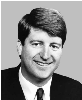
Patrick J. Kennedy of Providence (1st District) Democrat—2d term