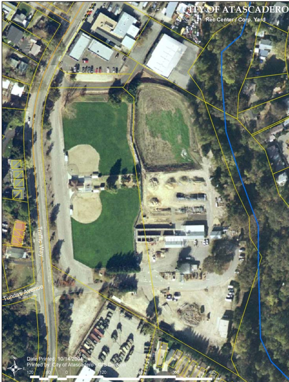
Figure 1. Aerial Photo of the 5599 Traffic Way Property When It Was Being Used as a Wastewater Treatment Facility, Colony Park Project Atascadero, San Luis Obispo County, California