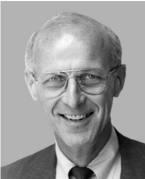
John W. Olver of Amherst (1st District) Democrat—6th term