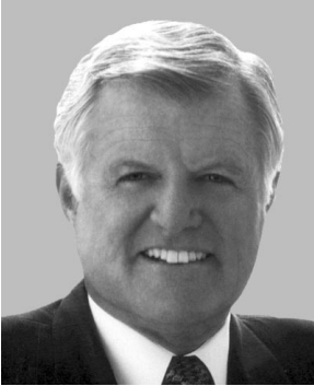
Sen. Edward M. Kennedy of Barnstable Democrat—Nov. 7, 1962