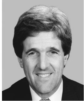
Sen. John F. Kerry of Boston Democrat—Jan. 2, 1985