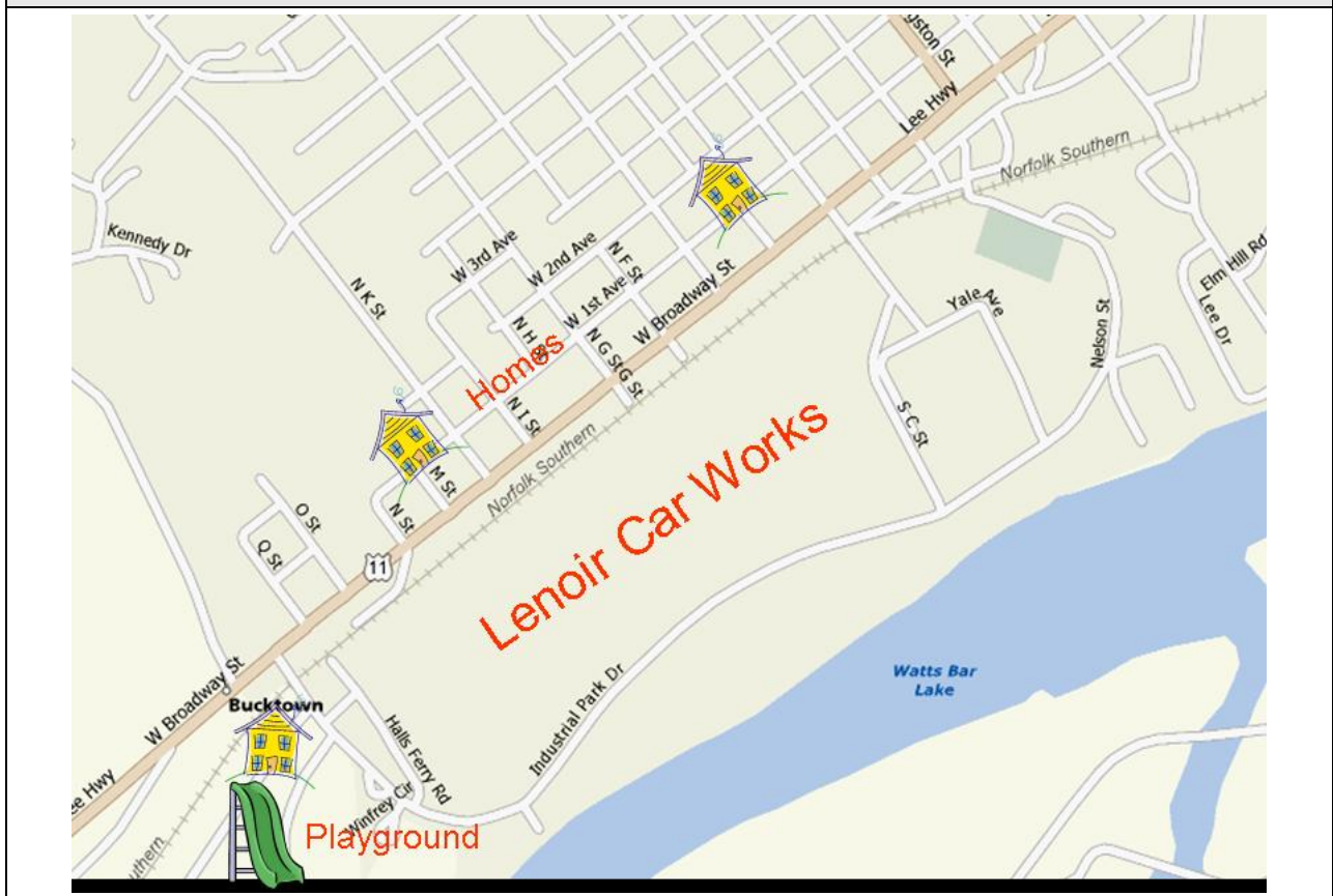
FIGURE 1. Map of 100-acre Former Lenoir Car Works and surrounding area.