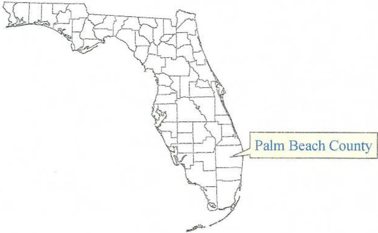
Figure 1 Mobile Medical Industries (MMI) County Location Map