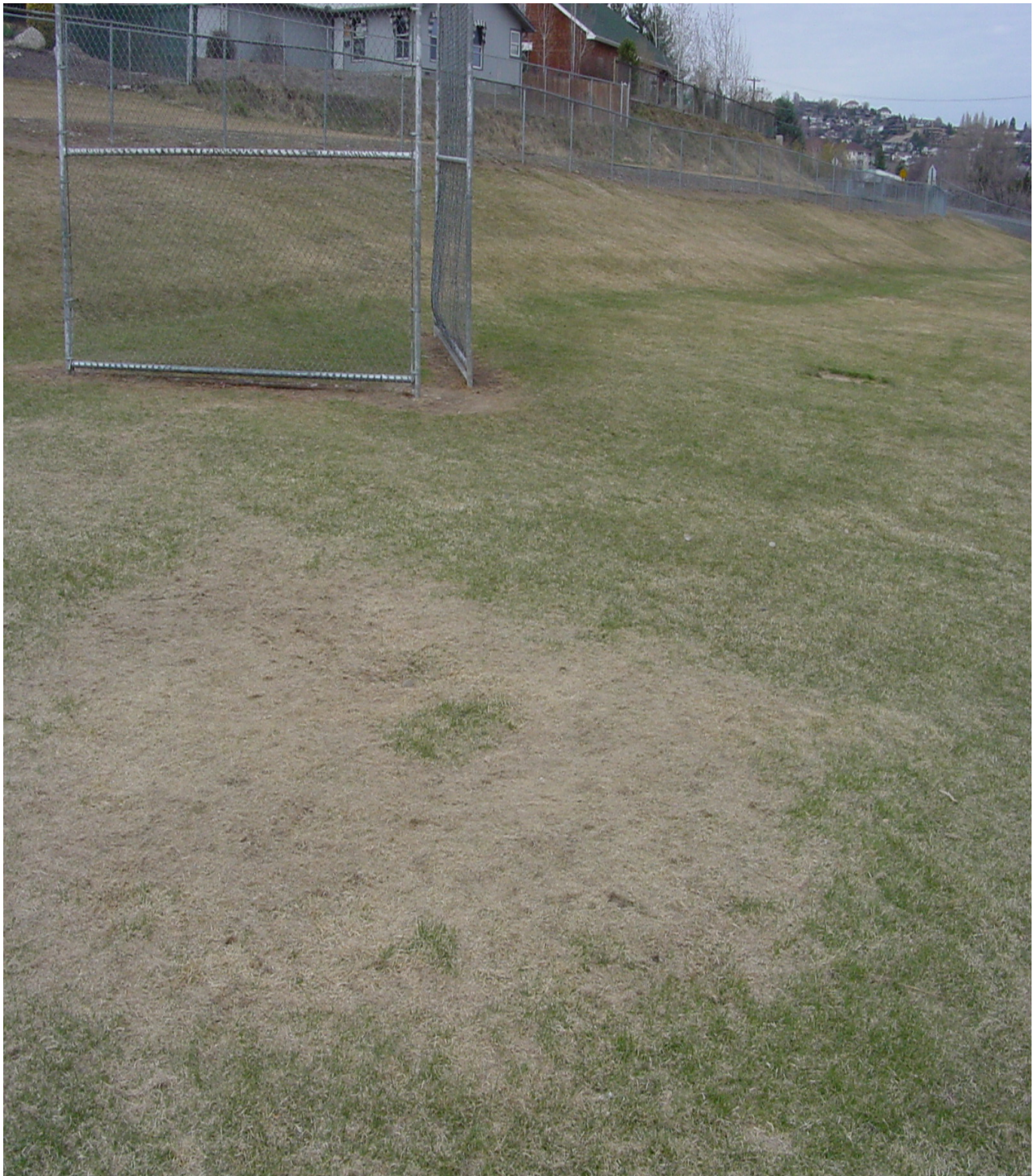
Figure 4. Robertson Elementary School playfields, Yakima Washington.