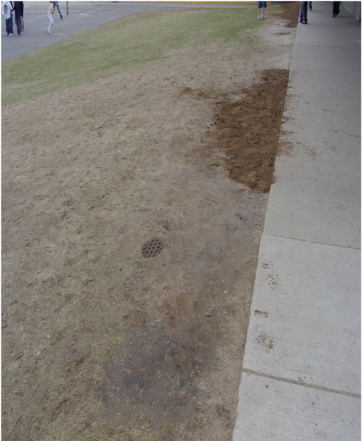
Figure 5. Robertson Elementary School playfields, Yakima Washington.