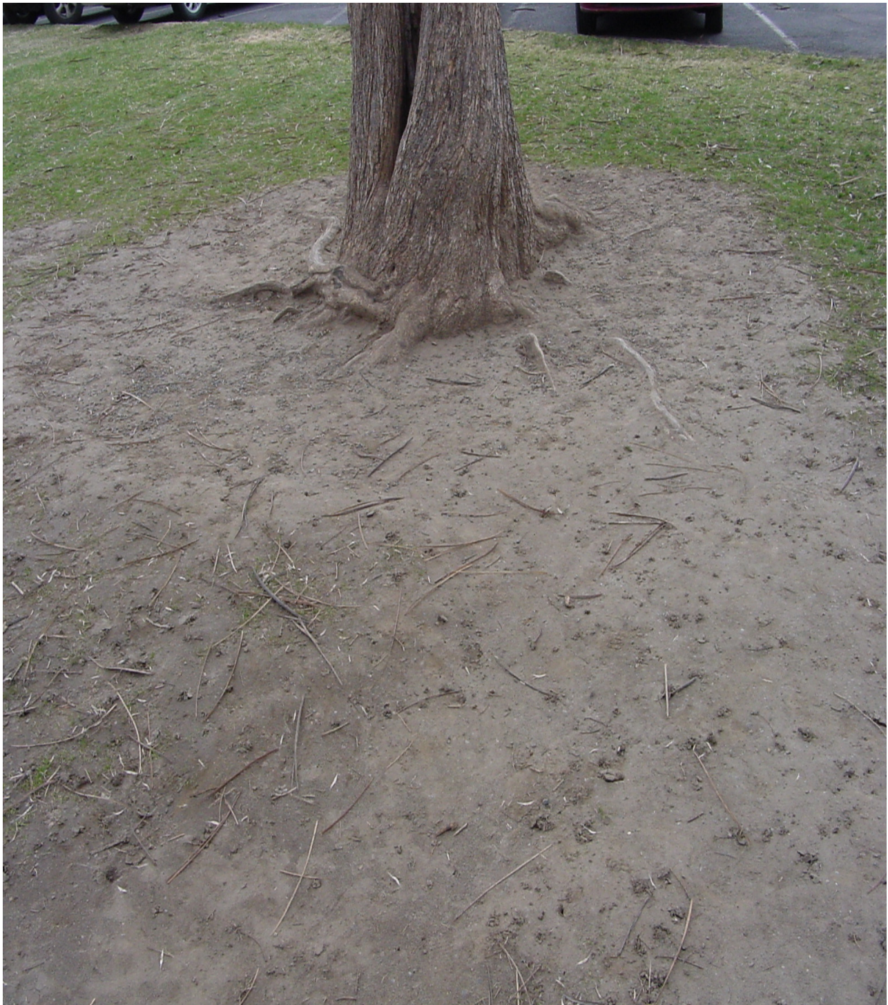
Figure 6. Exposed soil along trees, Robertson Elementary School, Yakima Washington.