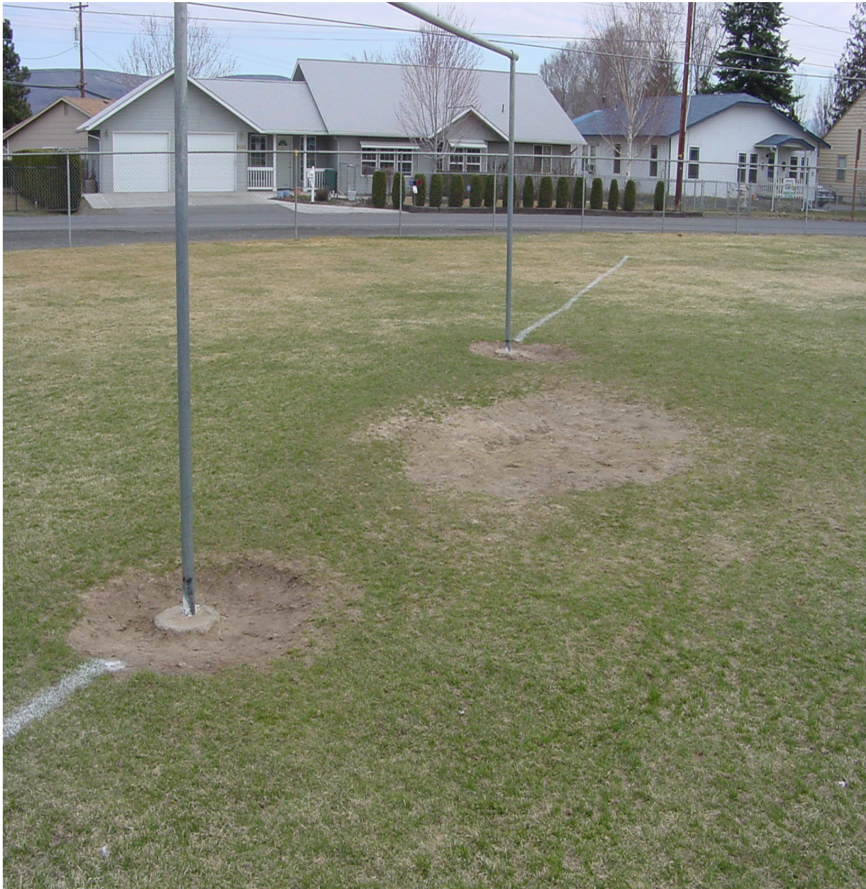
Figure 2. Exposed soil along soccer field, Robertson Elementary School, Yakima, Washington.