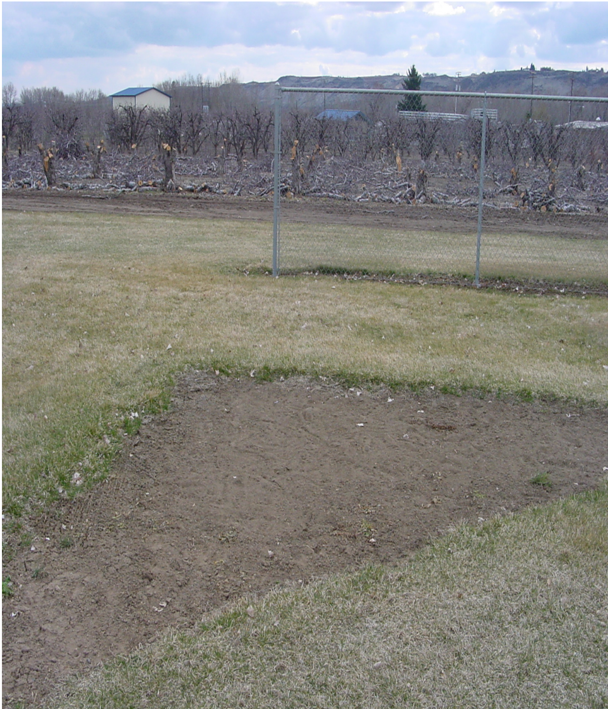
Figure 5. Naches Valley Intermediate School softball field with open access to an orchard land, Naches, Washington.