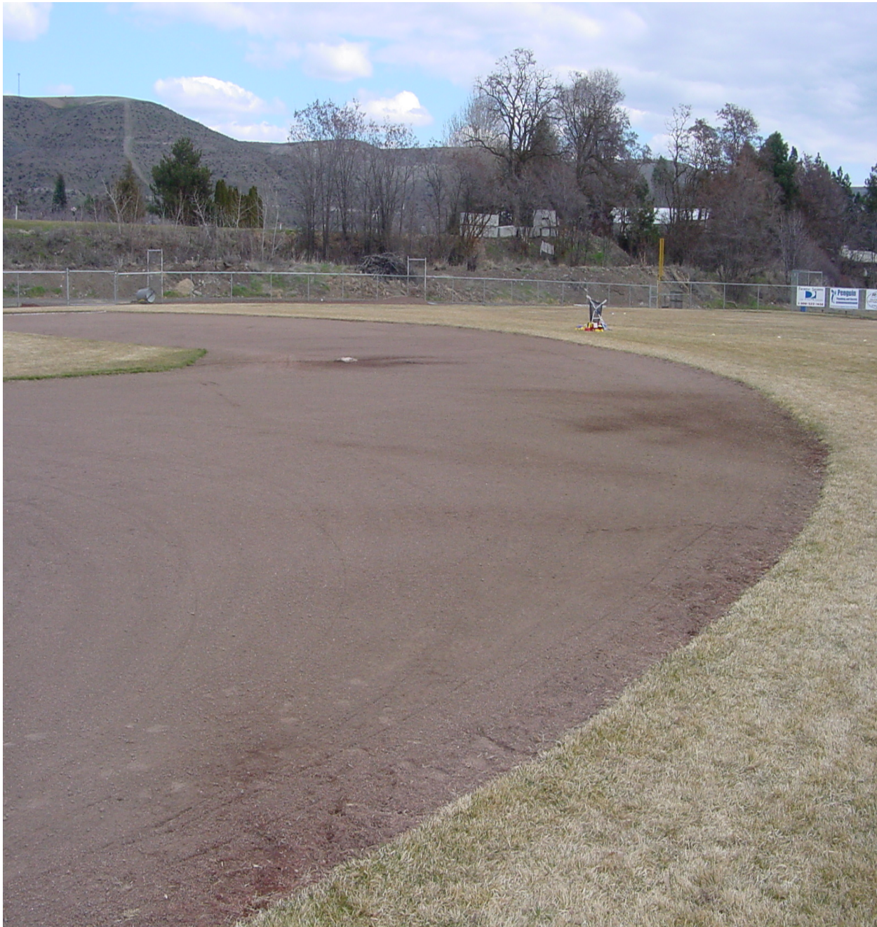
Figure 2. Exposed soil along baseball field, Naches Valley Intermediate School, Naches, Washington.