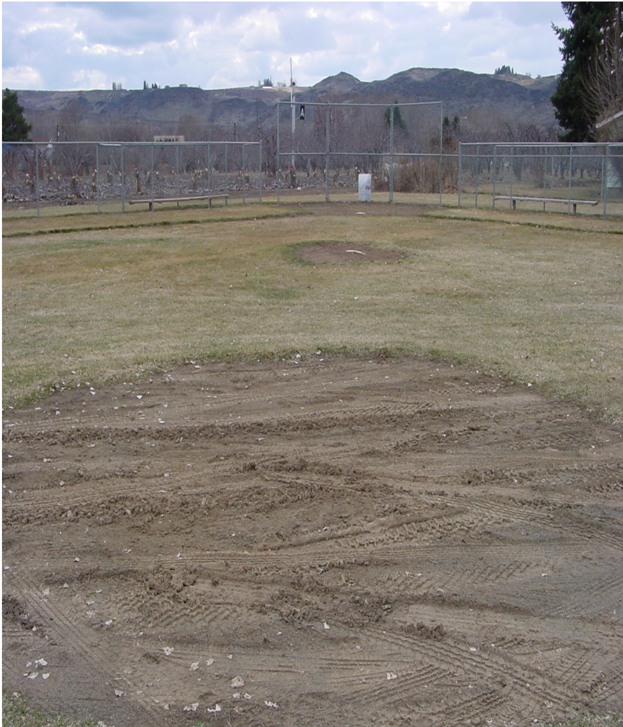
Figure 3. Softball field at Naches Valley Intermediate School, Naches, Washington.