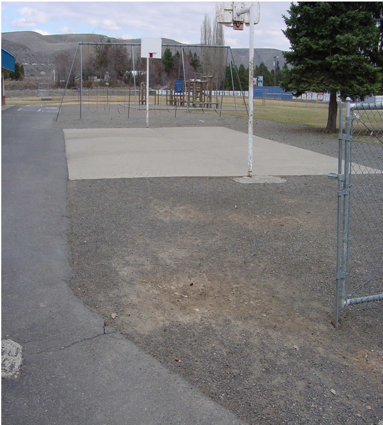
Figure 4. Naches Valley Intermediate School playfields, Naches, Washington.