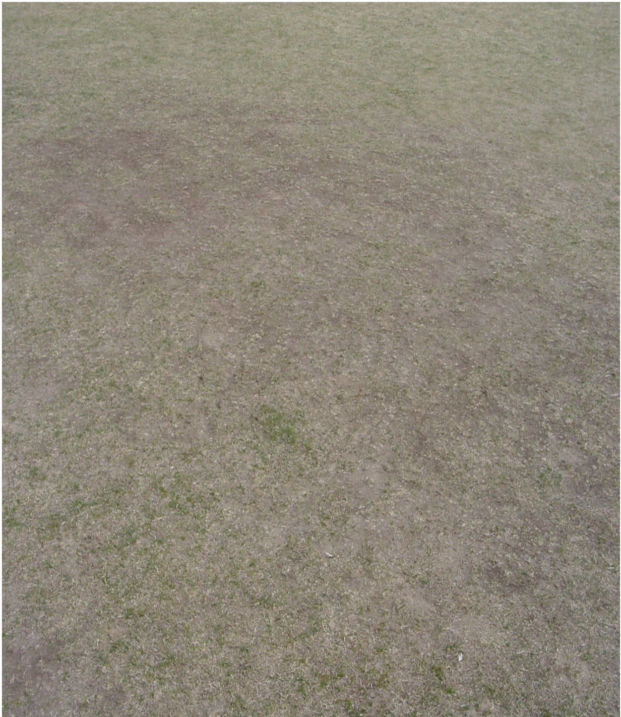
Figure 4. Gilbert Elementary School playfields, Yakima Washington.