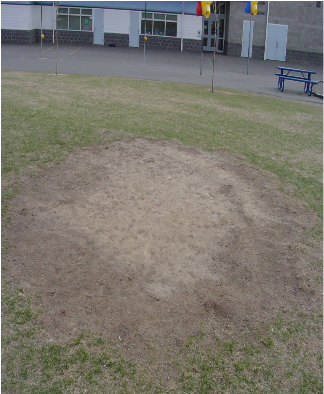
Figure 3. Playground field at Gilbert Elementary School, Yakima, Washington.