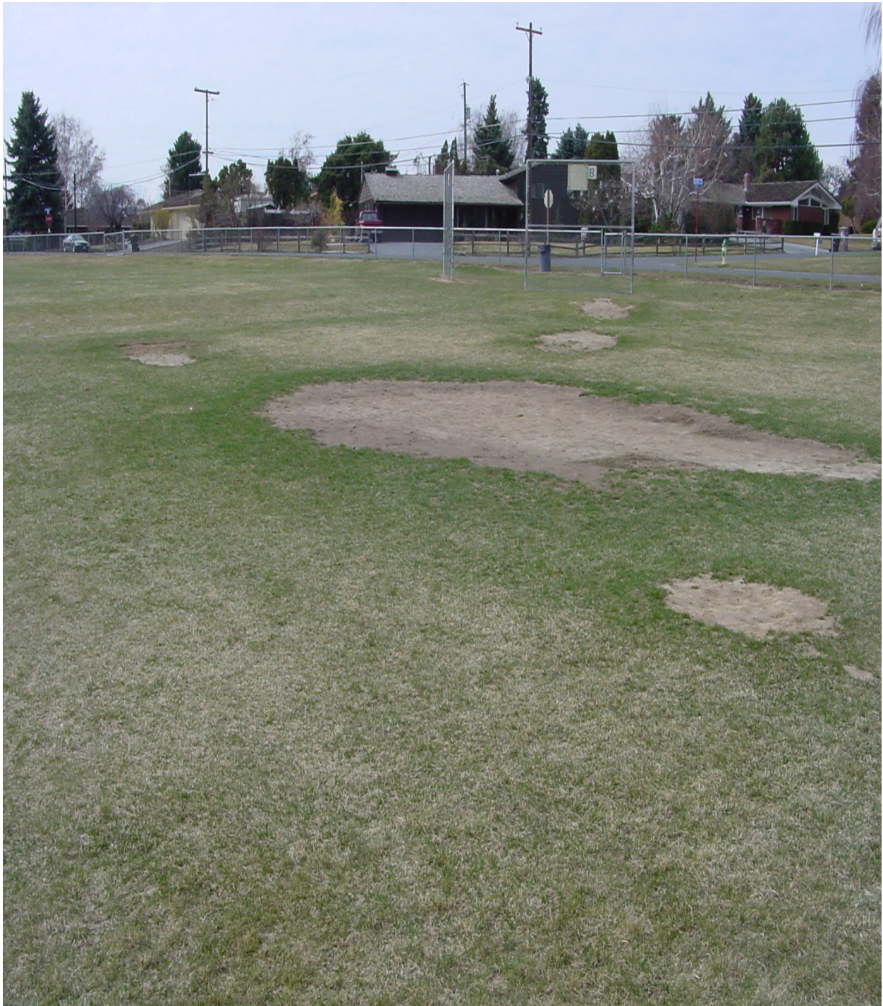
Figure 2. Exposed soil along baseball field, Gilbert Elementary School, Yakima, Washington.