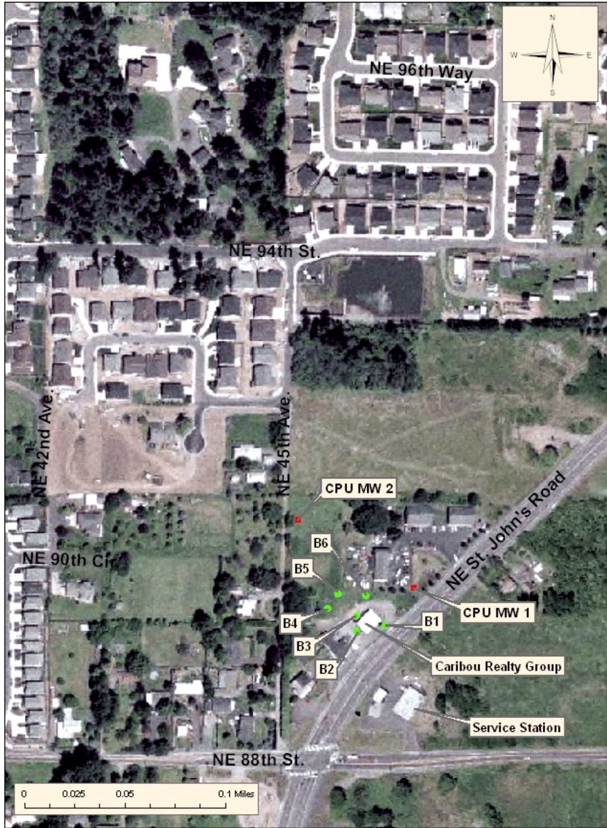
Figure 2: Site Map Caribou Realty Group Site Vancouver, Washington