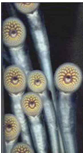
Figure 1. Sea lampreys ( Petromyzon marinus ). Note oral disk with concentric rows of teeth.

Six laboratory exposures were conducted in a continuous-flow dilution system to assess the levels where mussels are