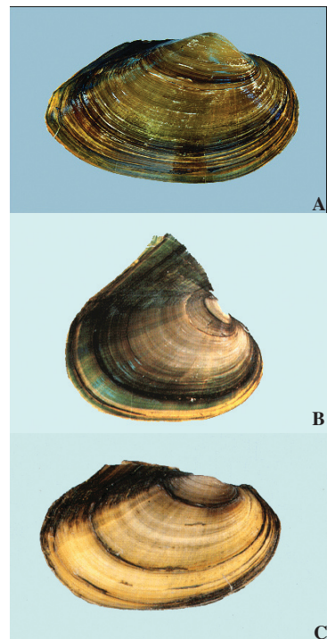
Figure 2. Three species of unionid mussels: (A) giant floater ( Pyganodon grandis ), (B) pink heelsplitter ( Potamilus alatus ), and (C) fragile papershell ( Leptodea fragilis ).

Table 1 represents acute toxicity results for the three unionid mussels compared to sea lamprey larvae after a 12-hour exposure to TFM. No mortality was observed among mussels at the observed MLC for sea lamprey of 2.6–