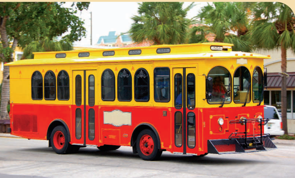
A brighter future? The Sun Trolley public transportation fleet in Fort Lauderdale, Florida, is one of the first in the United States to begin using biodiesel for its entire fleet.

Pure biodiesel, called B100, can generally be used only at higher temperatures: as it reaches the freezing point of water, B100 gels up and causes engine trouble. To use it in cold weather, drivers must install special heating systems to keep the fuel warm. Even pure diesel can gel up in extreme cold, Jobe says, and biodiesel blends at any level can exacerbate that problem. As an added hindrance, B100 has strong solvent properties that liberate rust and other engine contaminants, which plug filters and fuel injectors.