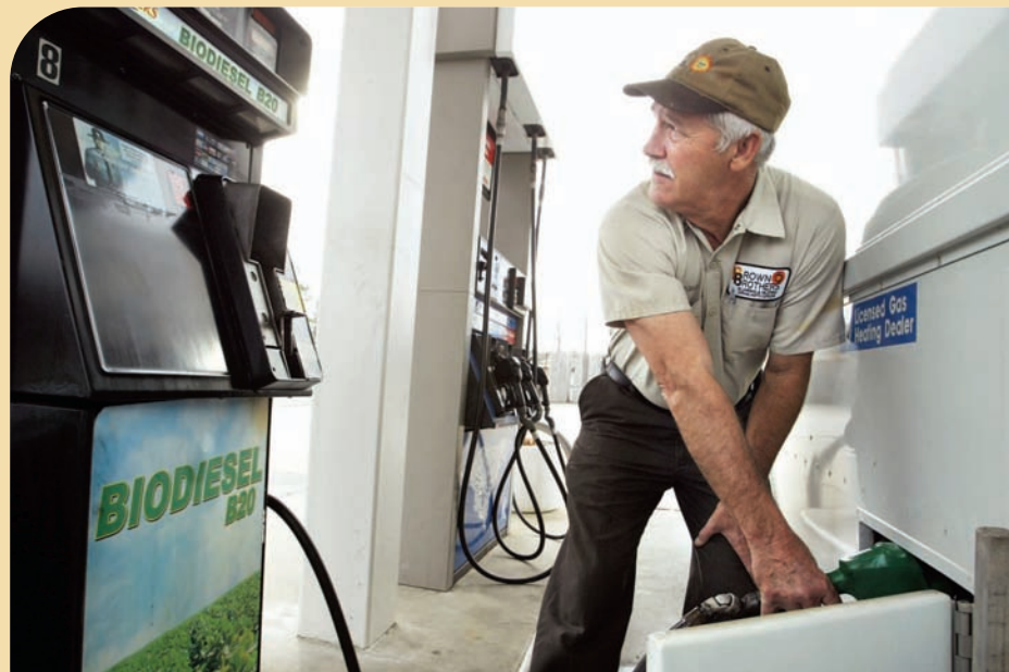
A new way to go. An Exxon station in Durham, North Carolina, offers a biodiesel mixture made from petroleum and organic feed sources such as soybeans, cooking oil, and animal fats.

Biodiesel, useable in any diesel engine, is now a key player in the alternative fuels market. Produced by industrial facilities that turn out millions of gallons annually, and also by