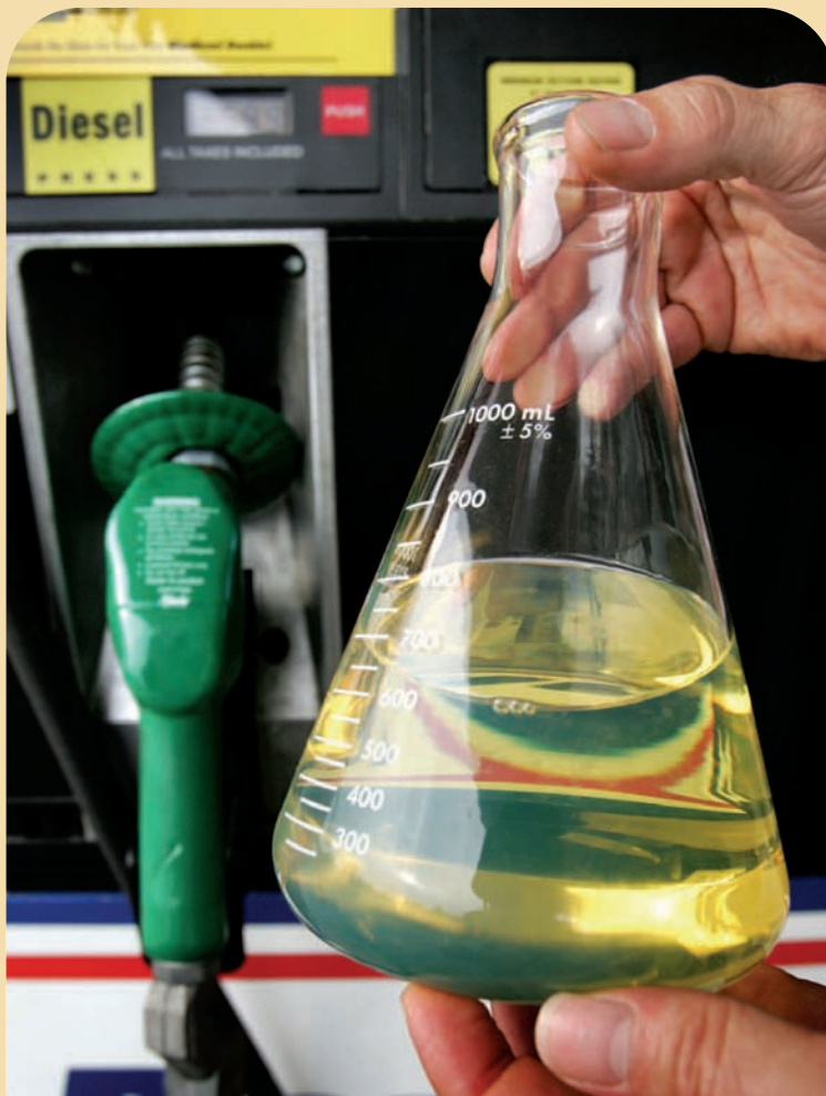
A healthier mix. A sample of B20 fuel containing 20% biodiesel and 80% standard diesel. Biodiesel made from chemically altered vegetable oil burns more cleanly than traditional diesel fuel.

Still, the EPA’s findings prompted the Texas Commission on Environmental Quality