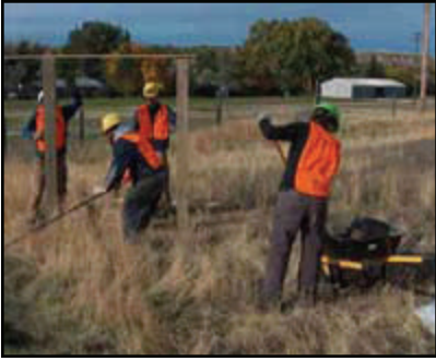
Photo of work crew installing New recreation area identification signs.

The Bureau of Reclamation and the Montana Conservation Corps (MCC) in Billings, completed a recreation enhancement project around Tiber Dam and Lake Elwell, near Chester, Montana.