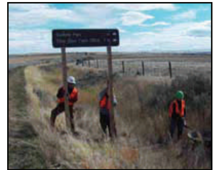
MCC crew installing the new signs around the Tiber Reservoir / Lake

The project was made possible through the hard work and dedication of Reclamation Montana Area Office staff, Reclamation Tiber Field Office staff and Montana Conservation Corps crew members. These new signs will enhance the recreation experience of visitors to Tiber Dam and Lake Elwell.