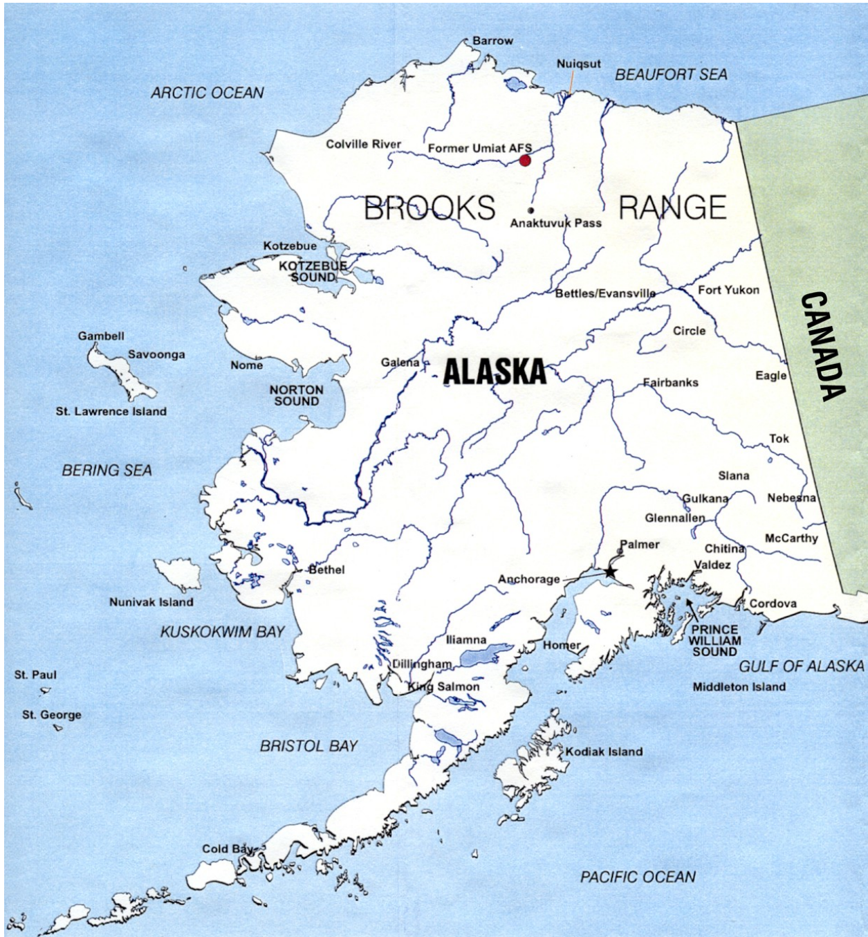
Figure 1. Location of the Former Umiat Air Force Station and Nuiqsut, Alaska