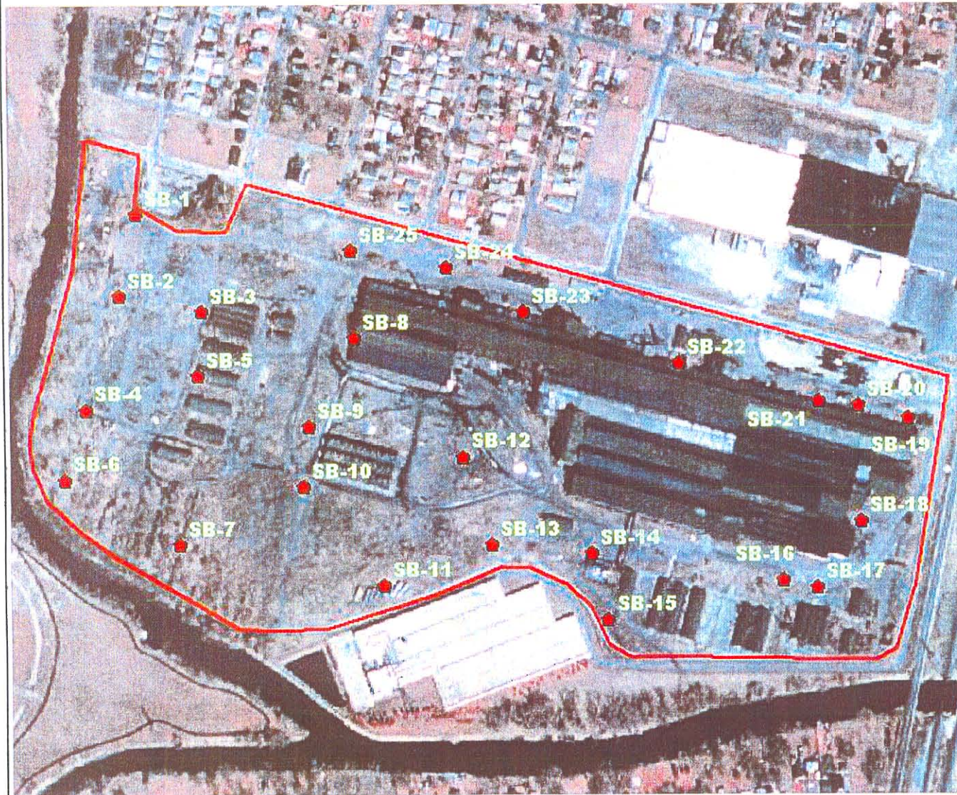
Figure 4 Soil Boring Sample Locations